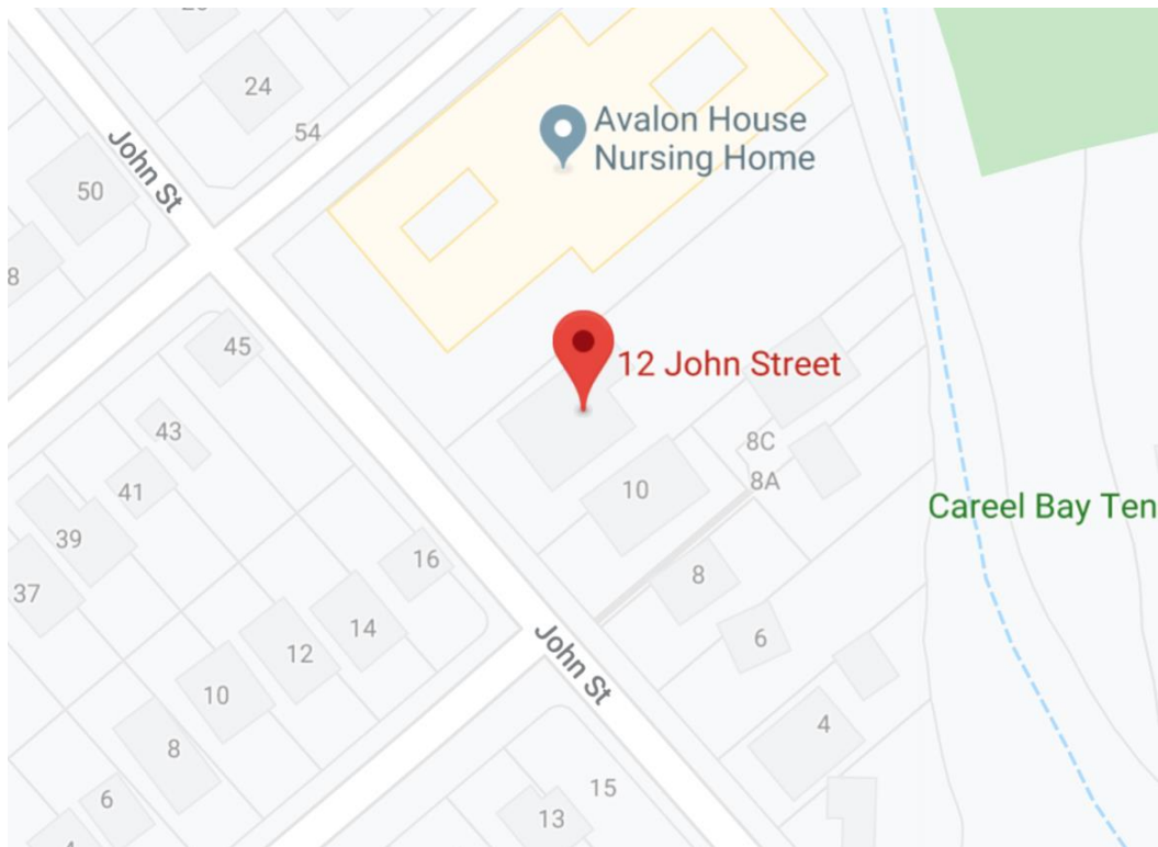
Fig 1: Location of Subject Site

The details of the existing site levels are indicated within the Survey Plan prepared by Bee & Lethbridge Pty Ltd, Reference No. 21070, dated 8 June 2018.