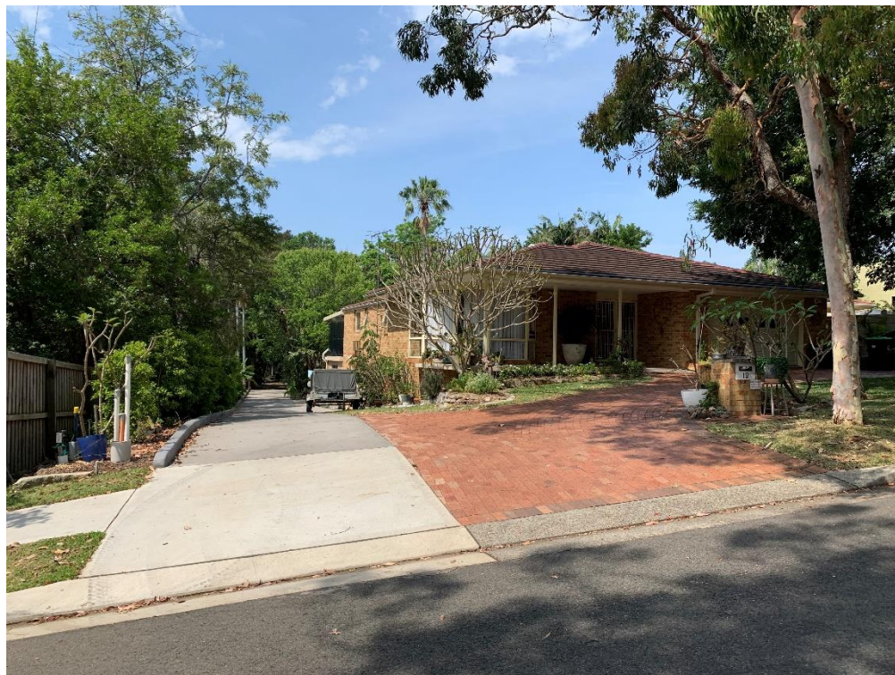
Fig 2: View of existing entry drive to the subject site, looking north-east from John Street