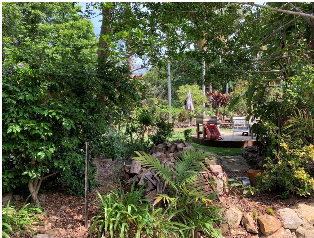
Fig 5: View looking south-east along common rear boundary with No 12 John Street