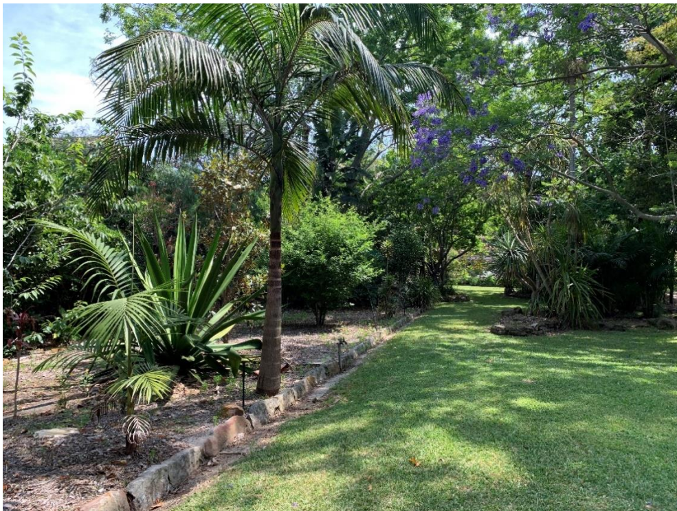
Fig 9: View looking west towards north-western boundary of the site and the adjoining Avalon House Nursing Home