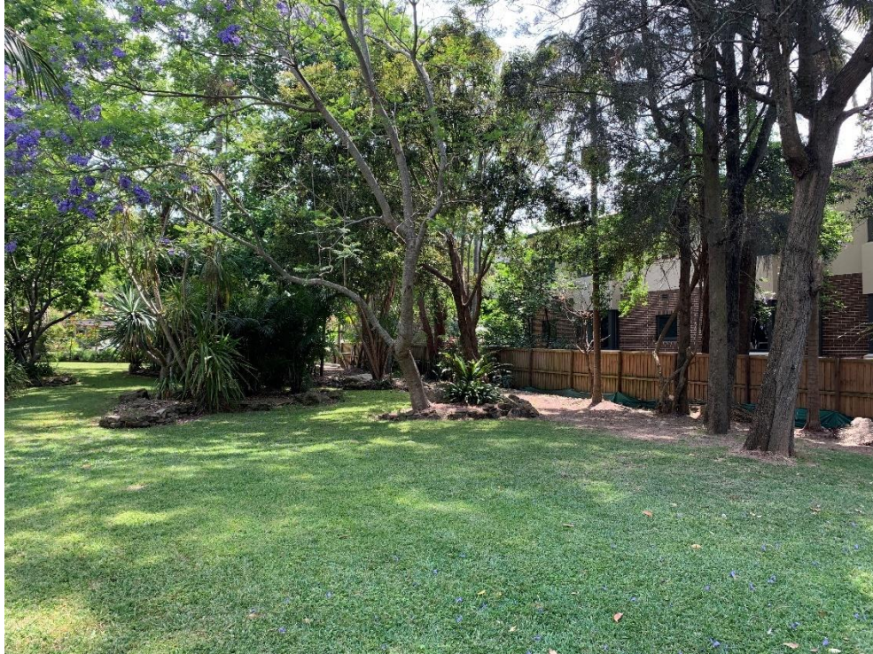
Fig 8: View looking west towards north-western boundary of the site and the adjoining Avalon House Nursing Home