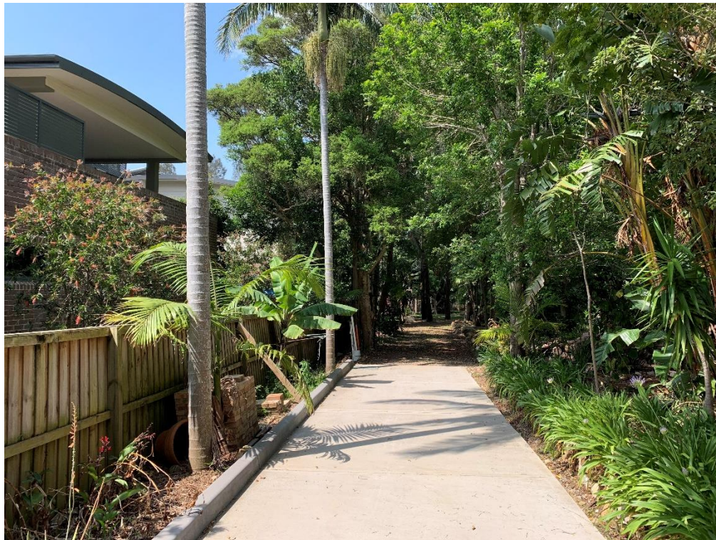
Fig 3: View looking north-east along existing entry drive to the subject site