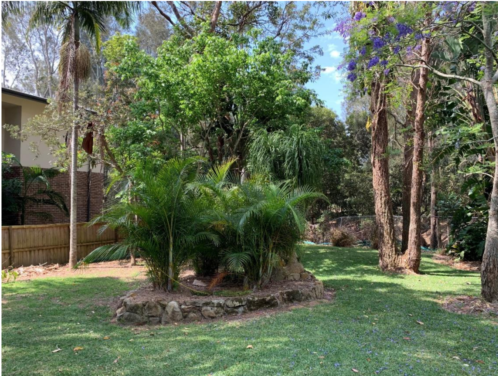
Fig 7: View looking north towards northern boundary of the site and the adjoining Avalon House Nursing Home