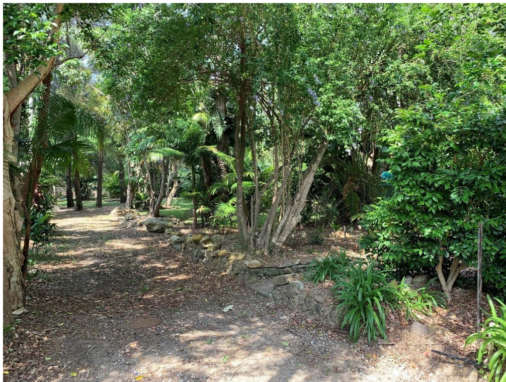
Fig 4: View looking north-east from the end of the existing entry drive to the subject site