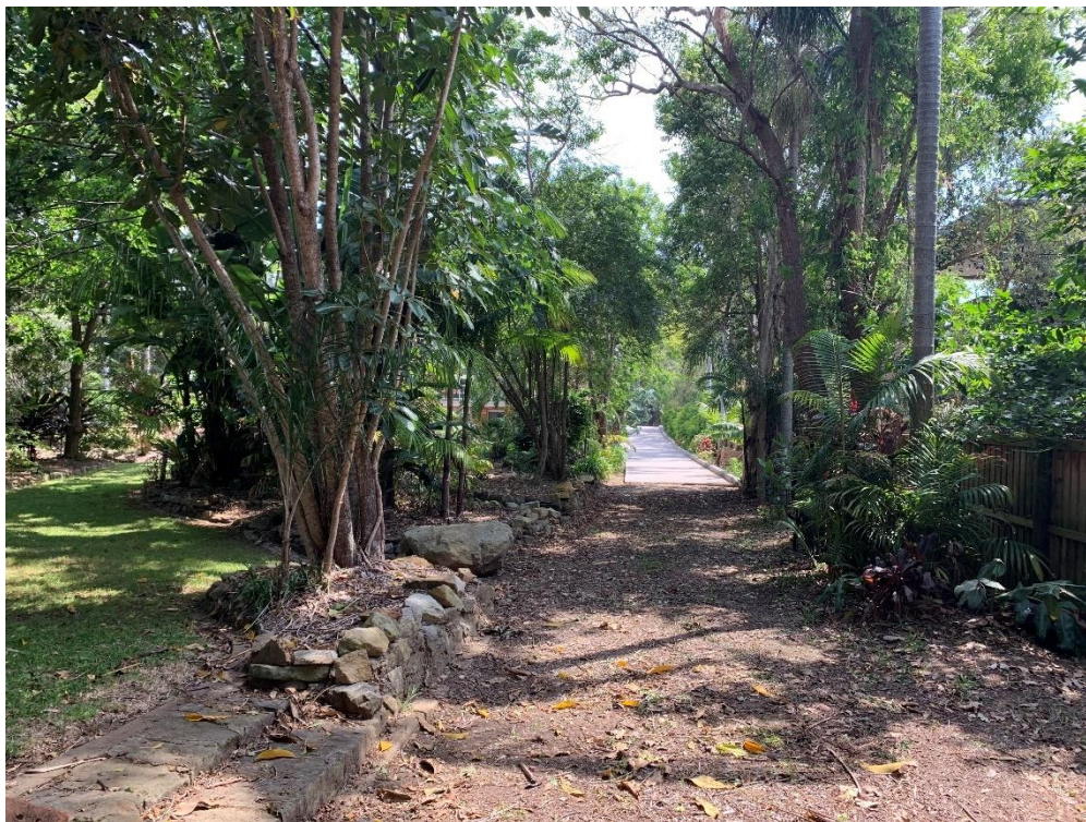
Fig 6: View looking south-west toward the end of the existing entry drive to the subject site