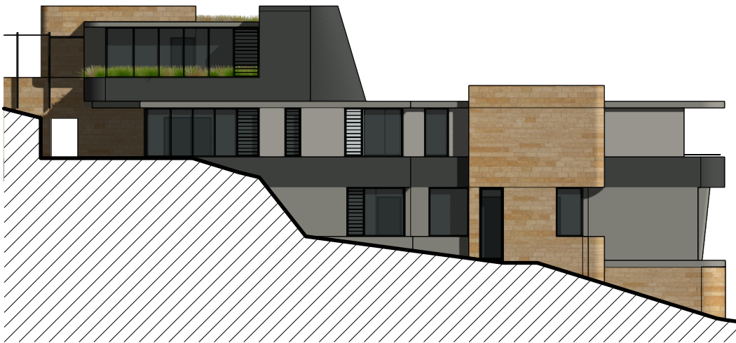
2 SOUTH-EAST ELEVATION Scale 1:200