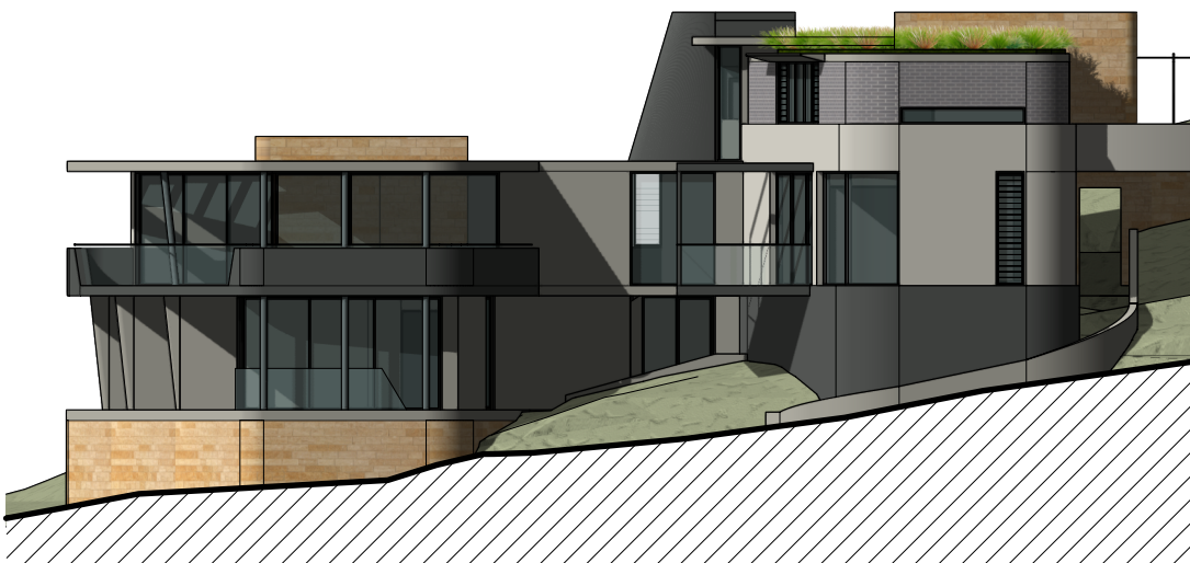
4 NORTH-WEST ELEVATION Scale 1:200