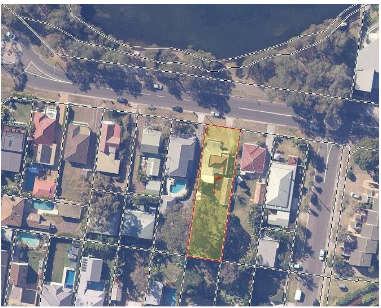
Aerial Photograph of Locality