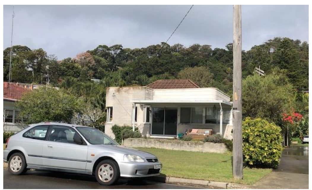
View of Subject Site from Mactier Street

The existing surrounding development comprises a mix of one and two storey detached residential dwellings on generally similar sized allotments to the subject site, interspersed with some three storey residential flat buildings. More recent development comprises larger two storey dwellings of modern appearance.