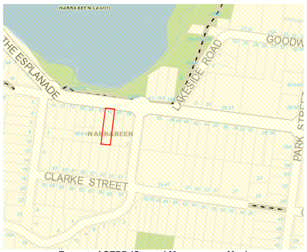
Extract of SEPP (Coastal Management Map)

This SEPP aims to manage development in the coastal zone and protect the environmental assets. The subject site is identified as 'coastal environment area' and 'coastal use area' on the Coastal Management Map and therefore the provisions of this SEPP apply. The following Clauses are relevant to the proposed development: