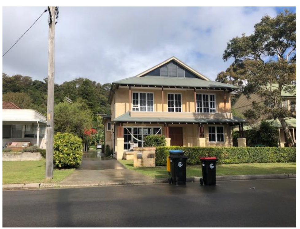
View of No. 64 Mactier Street

The compatible form and scale of the new dwelling will meet the housing needs of the community within a single dwelling house which is a permissible use in this low density residential zone.