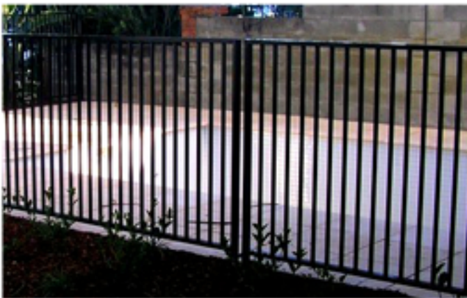
BLACK ALUMINIUM FENCE