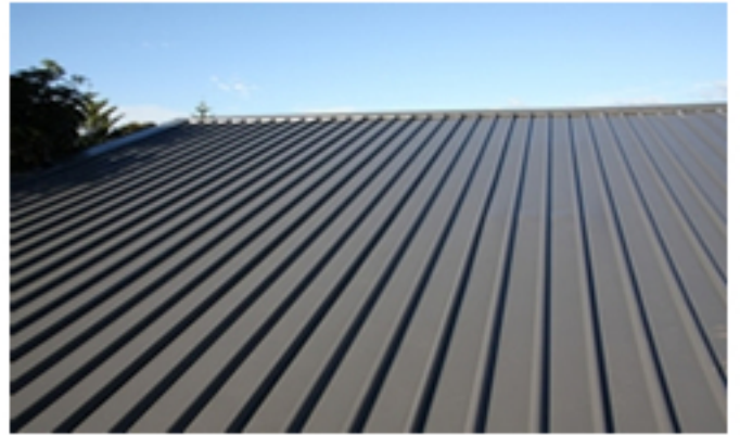
COLORBOND ROOFING - GREY