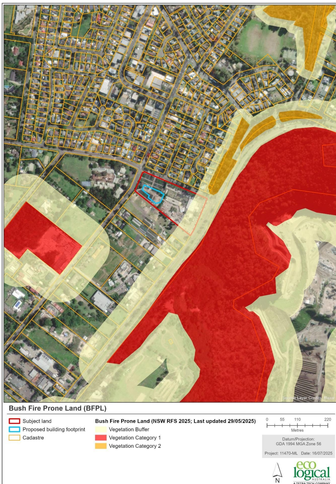
Figure 1: Bush Fire Prone Land (BFPL) mapping (RFS 2025)