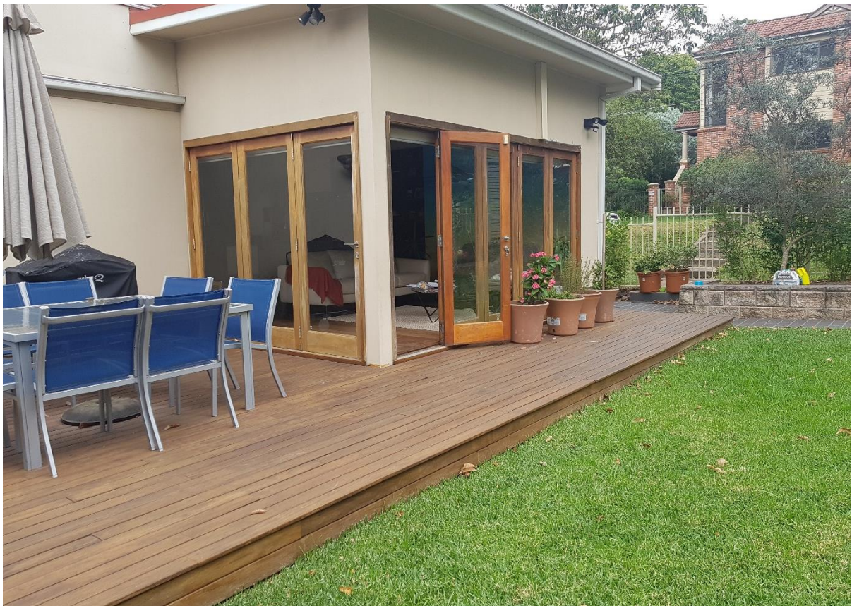
Figure 7 – Existing deck at the rear of the site (Corona Projects, May 2019)