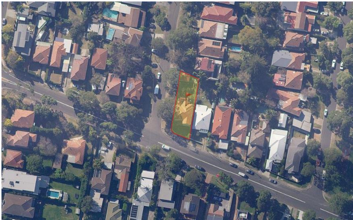
Figure 2 – Aerial map (SIX Maps)

The site is a corner lot that is rectangular in shape with a total area of 463 square metres by survey, with a 9.62 metre street frontage to Woodbine Street. The western side boundary measures 35.095 metres and the eastern side boundary measures 38.025 metres. The rear boundary measures 12.55 metres. The site falls from the rear towards the street by approximately 1.36 metres.