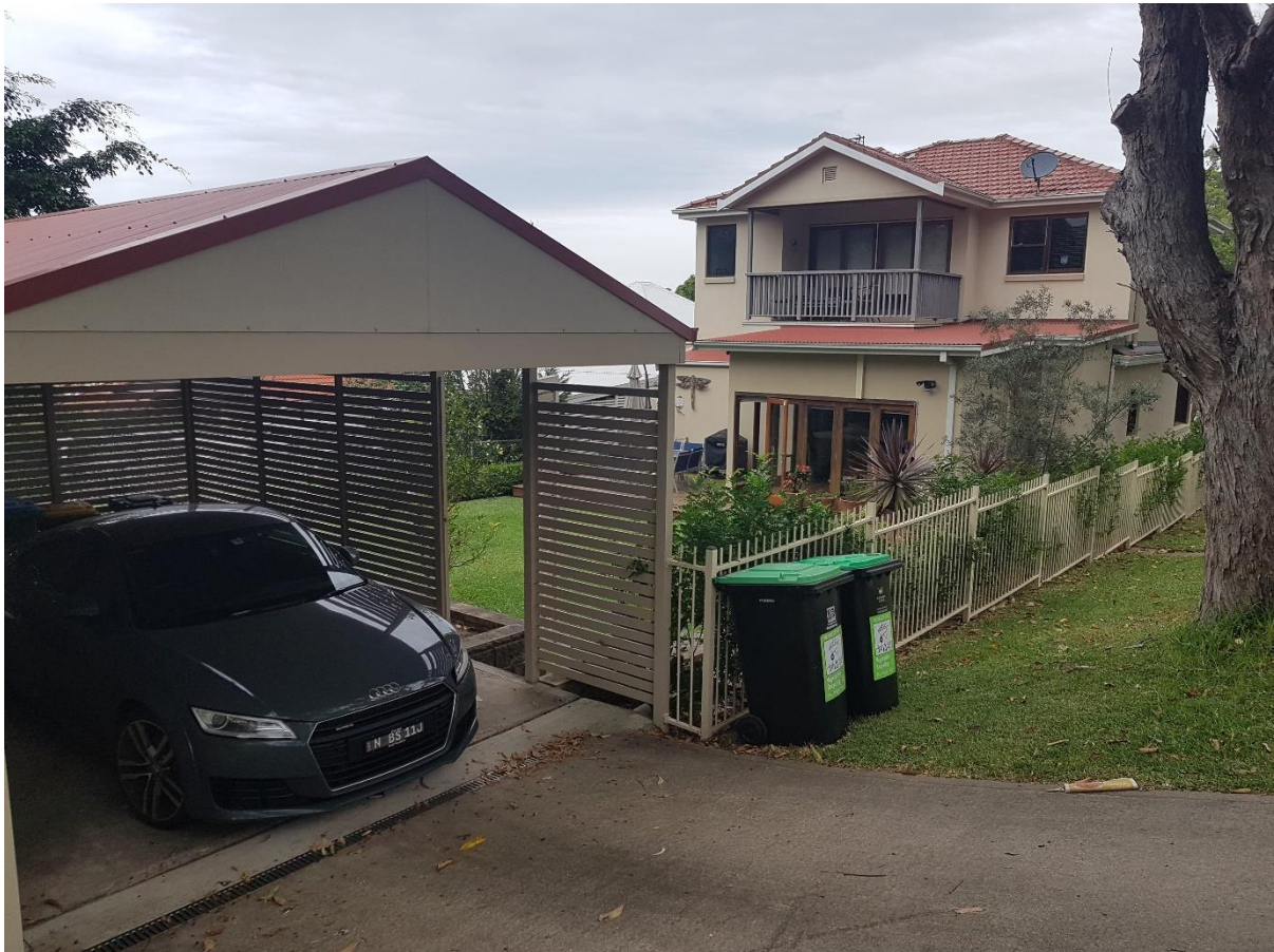
Figure 3 – Subject site as viewed from Kalauli Street.

The land is zoned R2 - Low Density Residential under the provisions of Warringah Local Environmental Plan 2011 (WLEP 2011). The site is not located within a heritage conservation area. The site adjoins a heritage item at King Street—Manly Dam (I84).