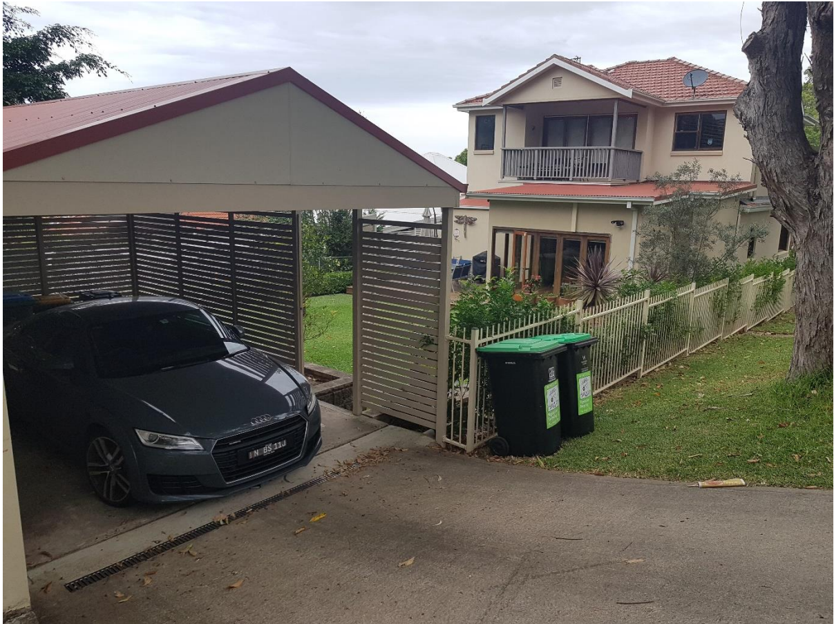
Figure 10 – View of the No 28 private open space from Kalauli Street (Corona Projects 2019)