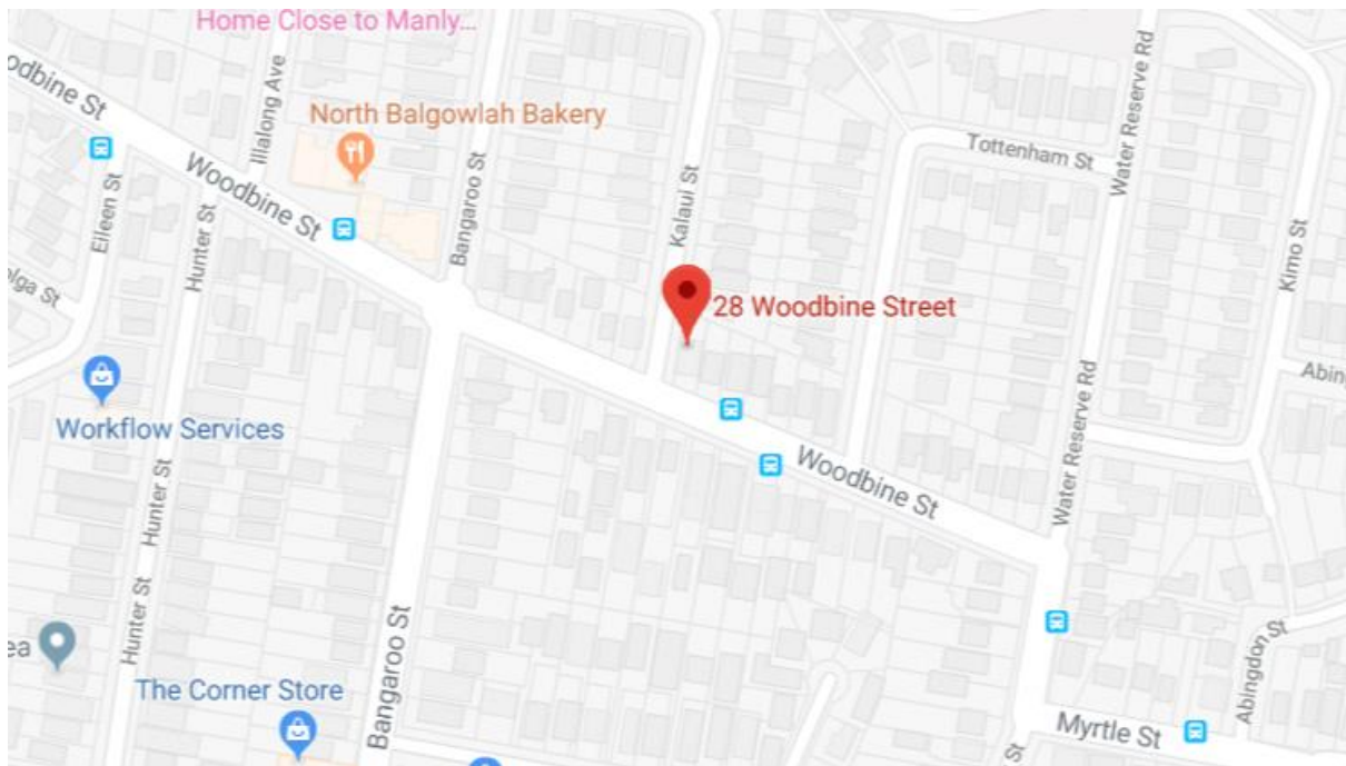
Figure 1 – Site locality map