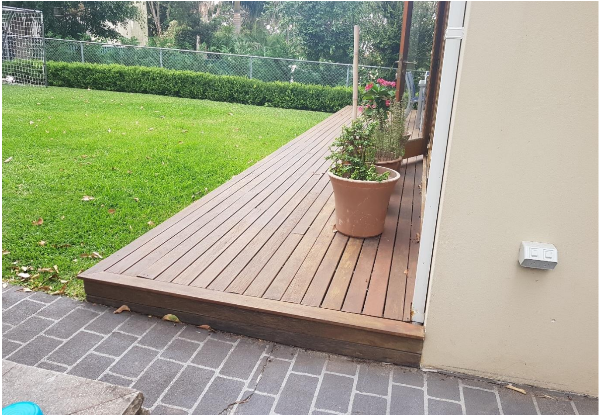
Figure 6 – Existing deck at the rear of the site (Corona Projects, May 2019)