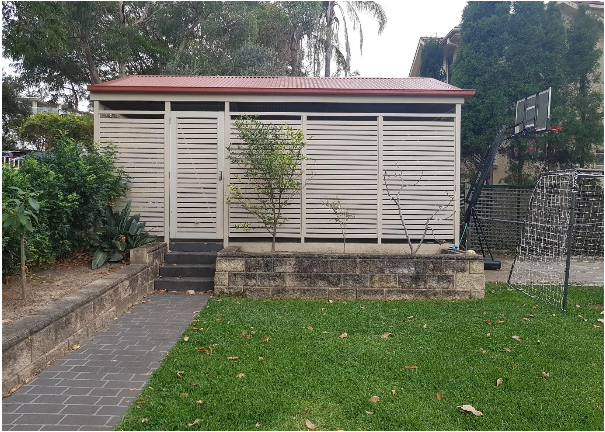
Figure 4 – Existing garage at the rear of the site (Corona Projects, May 2019)