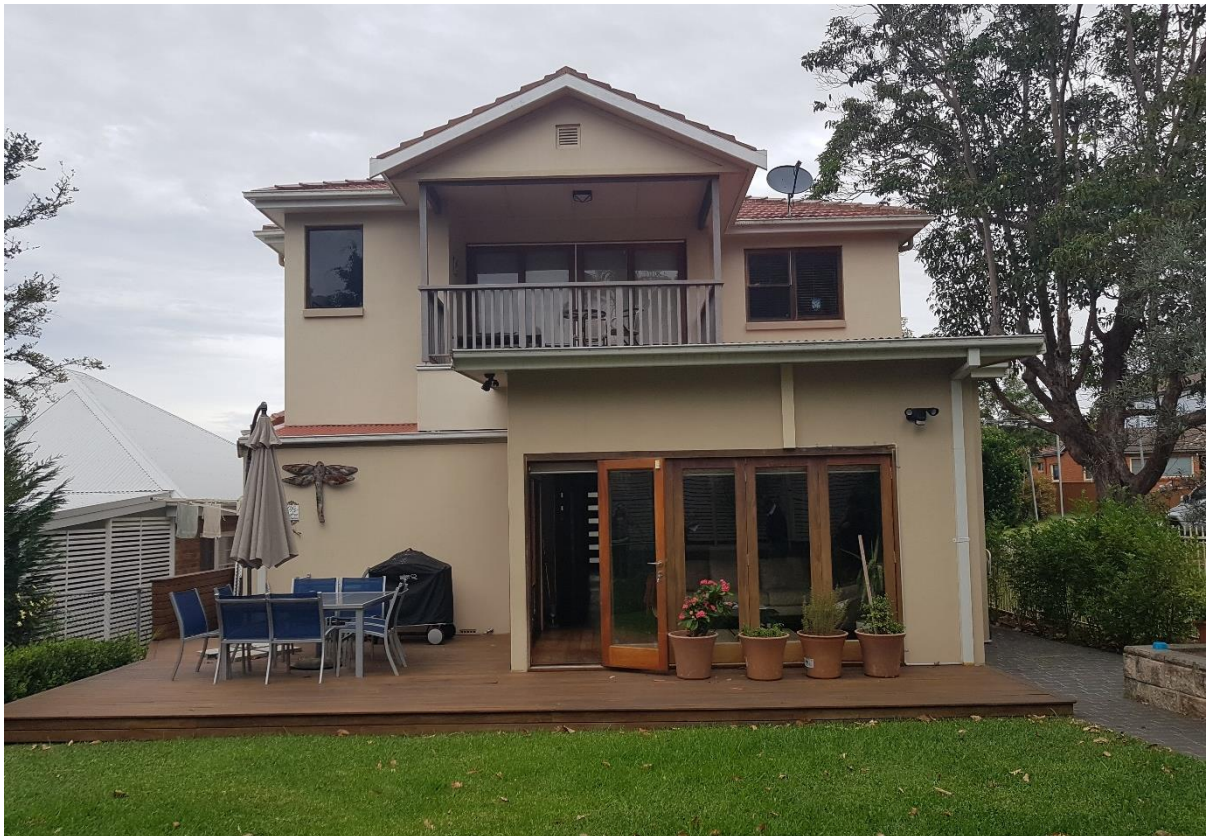
Figure 5 – Primary dwelling as viewed from the rear of the site (Corona Projects, May 2019)