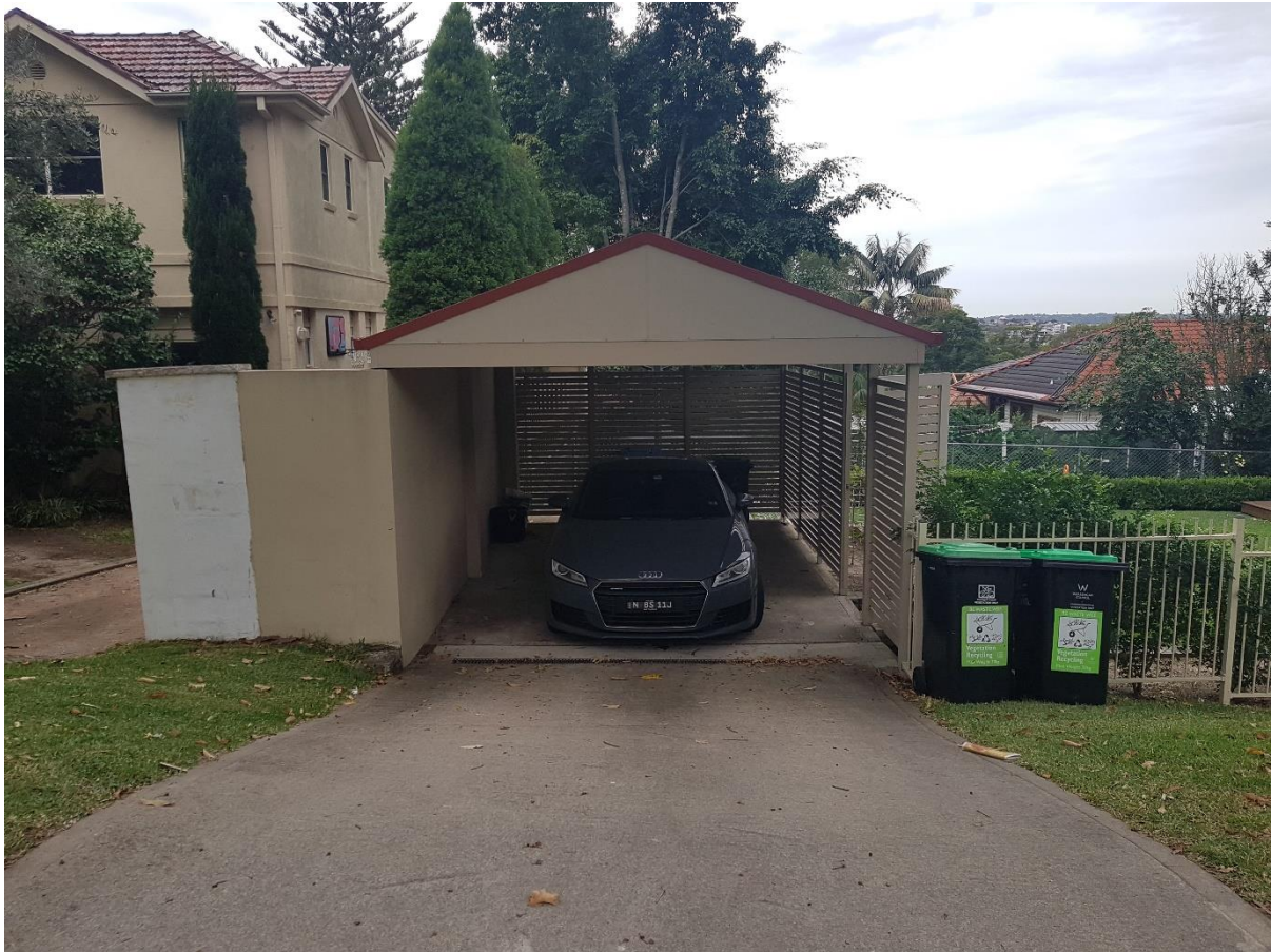
Figure 8 – Existing garage as seen from Kalau Street. (Corona Projects, May 2019)