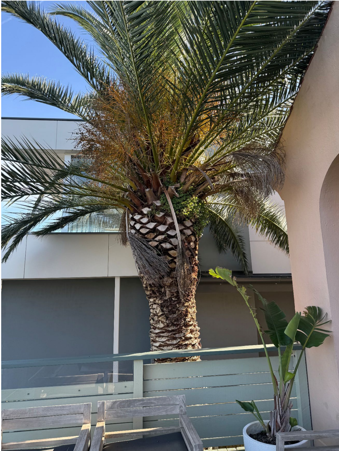
Figure 5: Tree 1