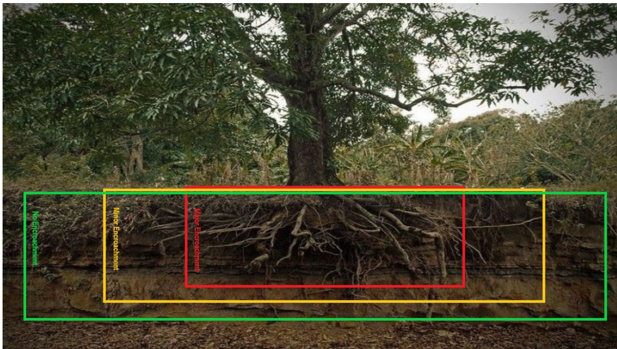
Figure 2: Encroachment zones