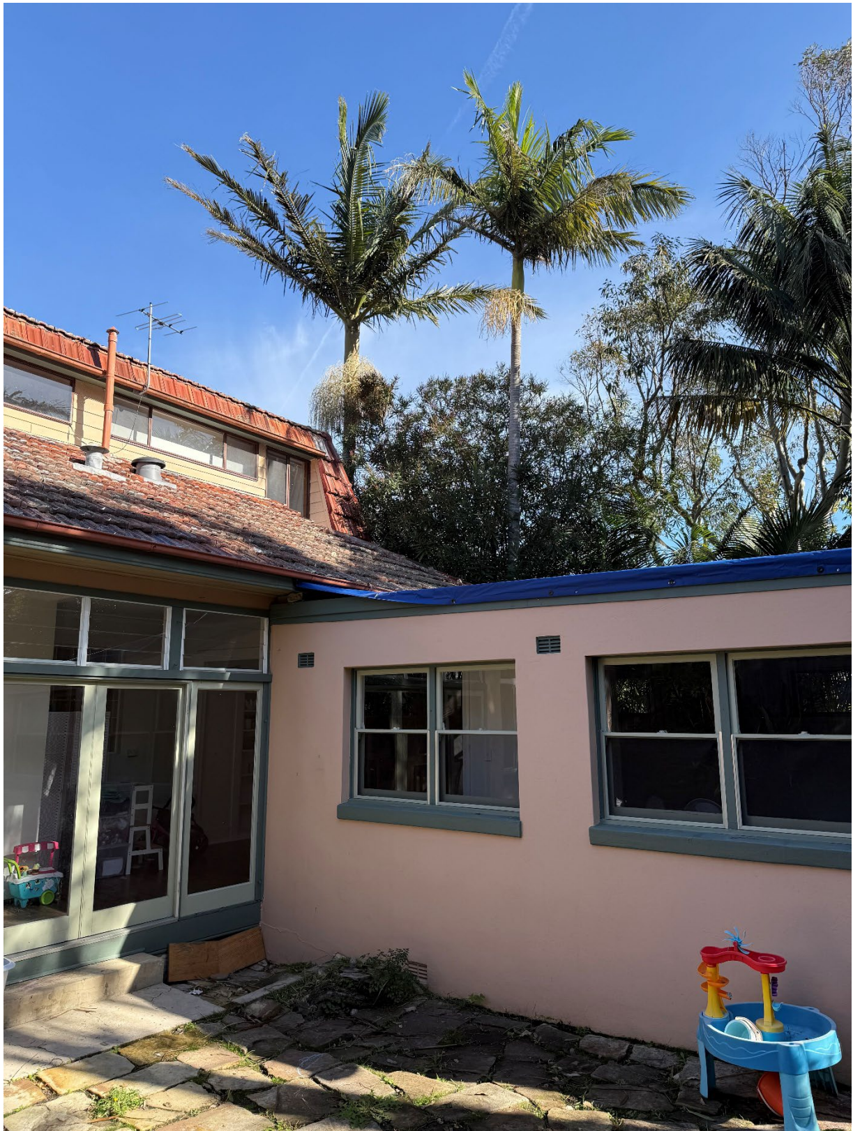
Figure 6: Trees 2-4