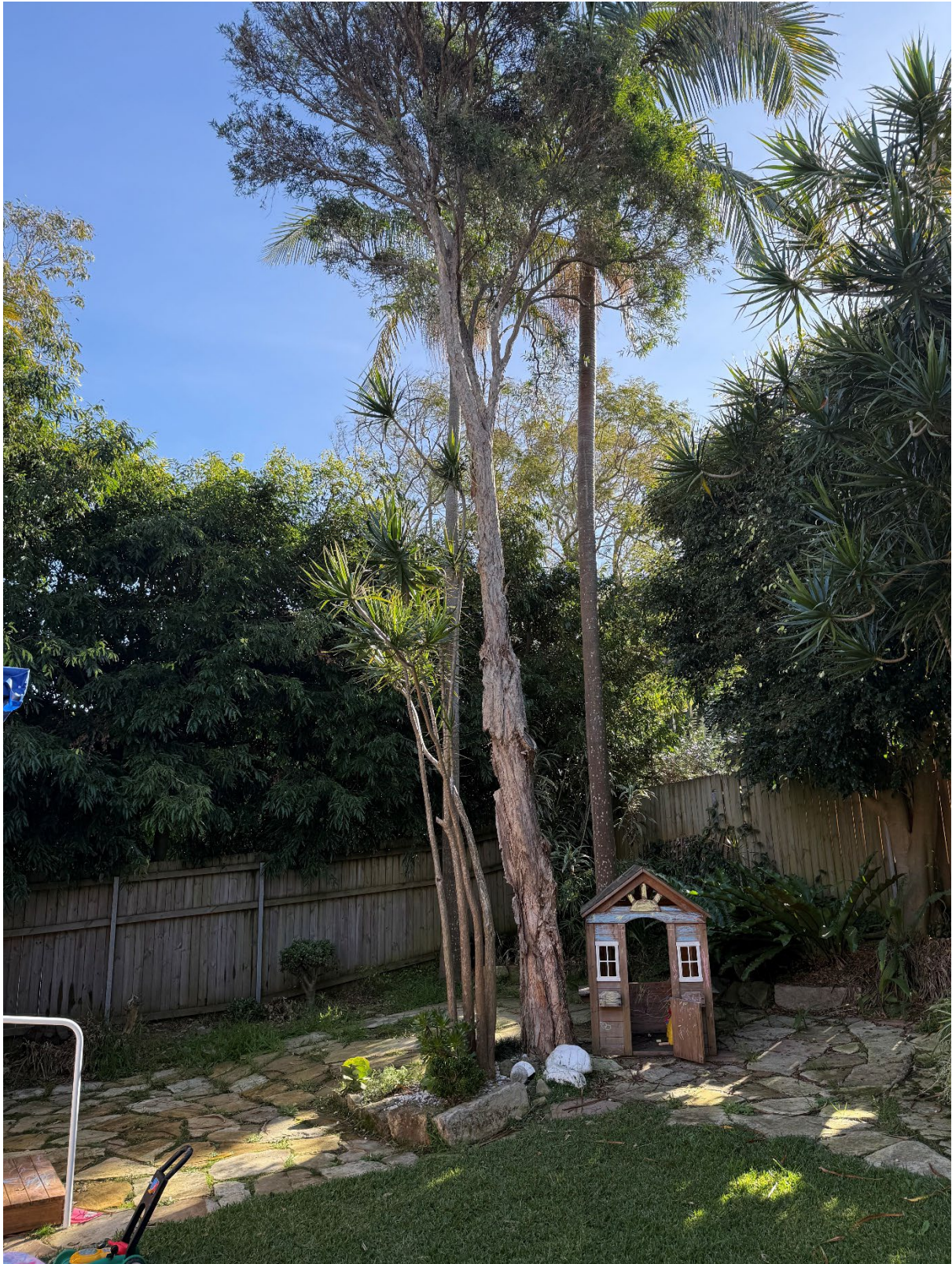
Figure 7: Trees 8-12