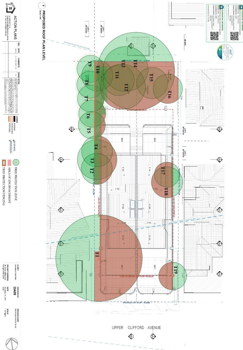
Figure 3: Tree locations

Below is an image of the tree locations showing the TPZ and encroachments.