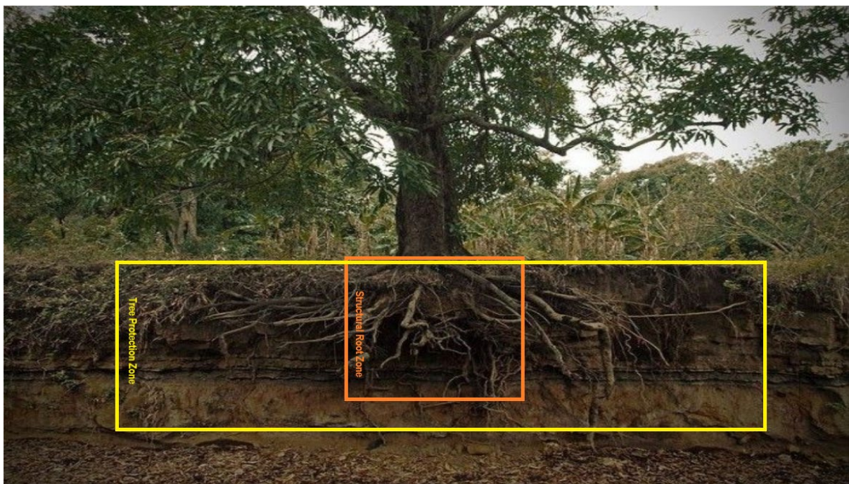
Figure 1: TPZ and SRZ cross section

All TPZ measurements are provided in the tree assessment data in table 2 .