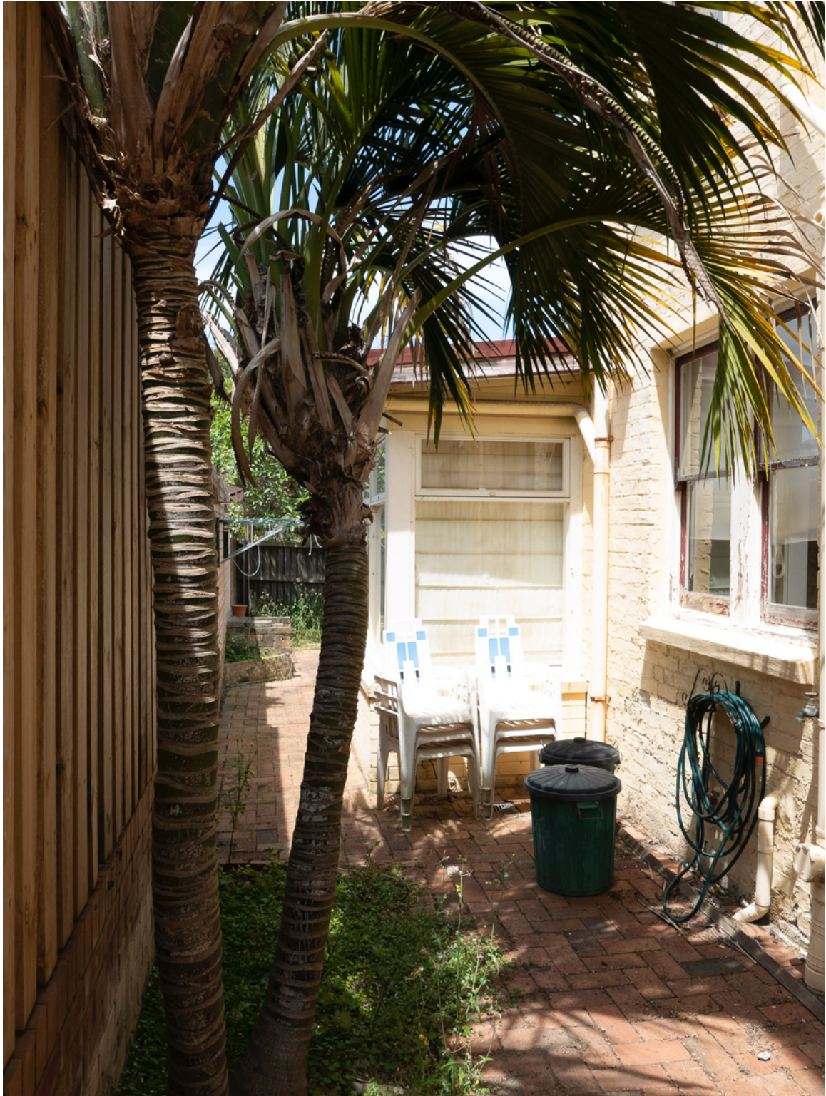
View along the existing boundary fence