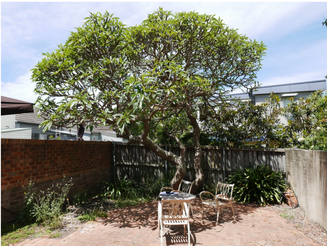
Looking towards the rear property boundary