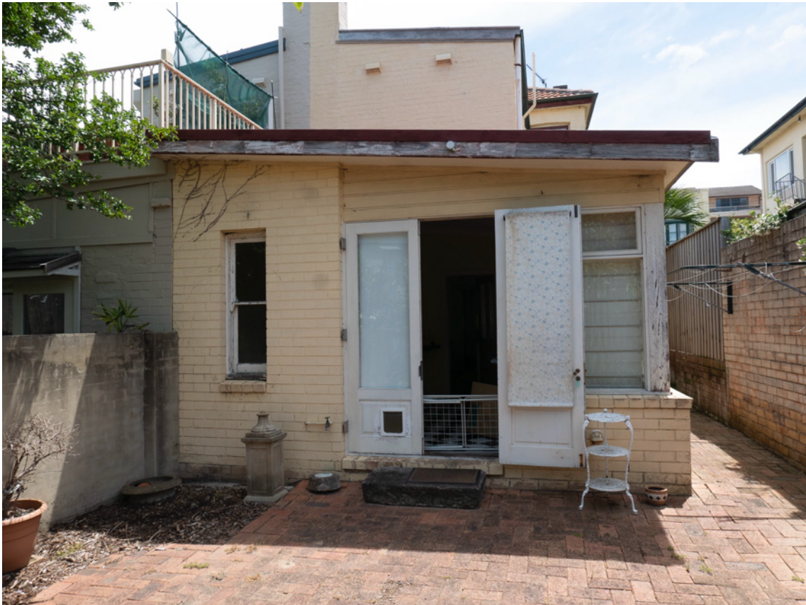
View towards the rear of the existing Residence