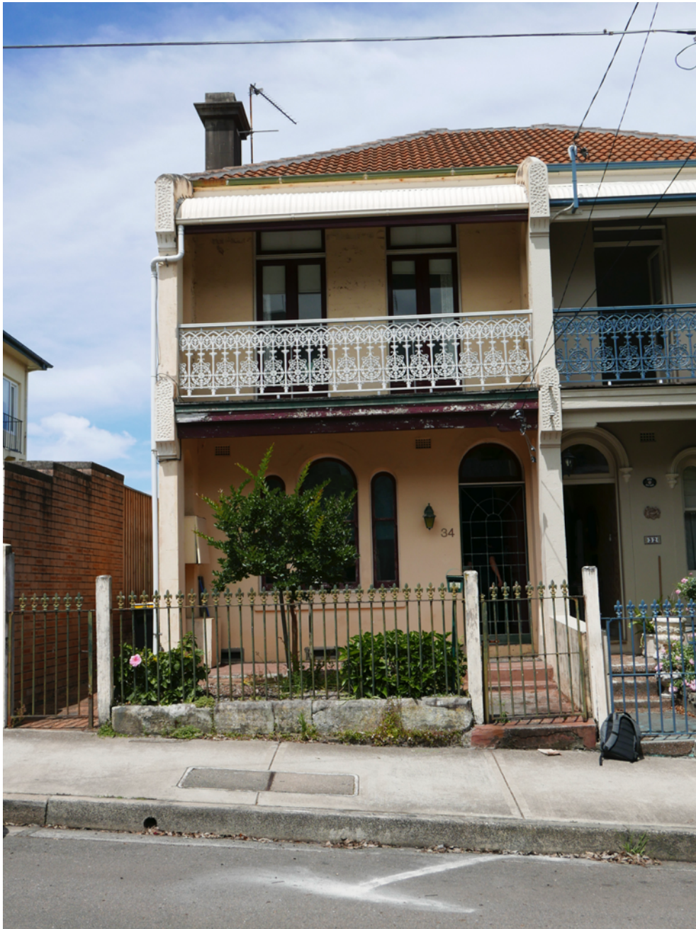
View to the front of the existing residence from George Street