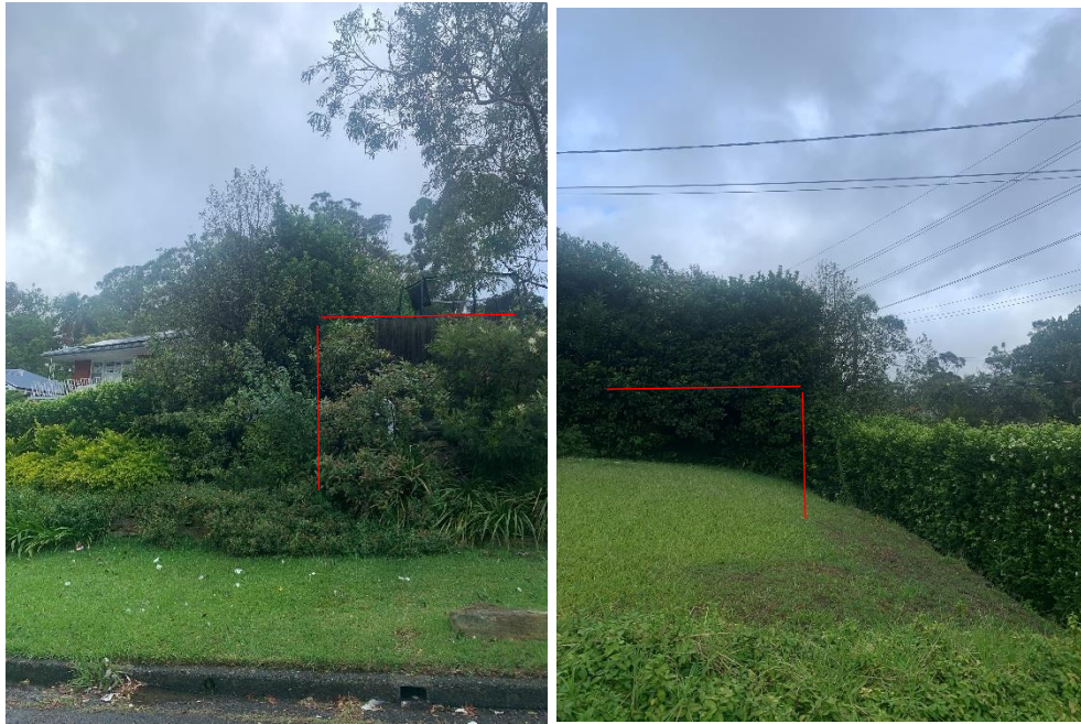
Images showing the approximate fenceline of 96 Park Street.