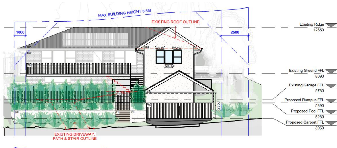
Proposed elevation concept drawing from front of property.