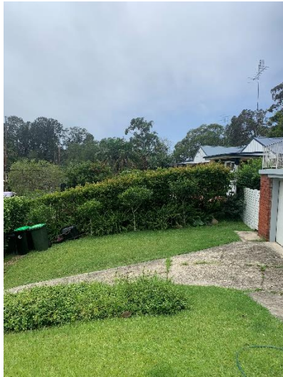
Image across proposed development site to 6 Kunari Place front of home.

This is a single storey home with basement garage and a secondary dwelling (granny flat style adjoining main building) on the southern boundary.