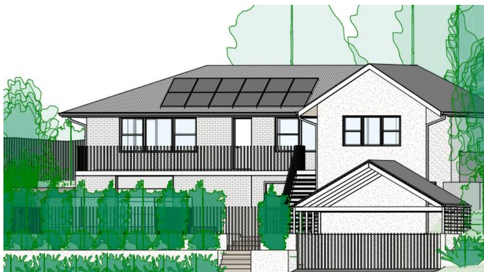
Concept drawing from front of property.