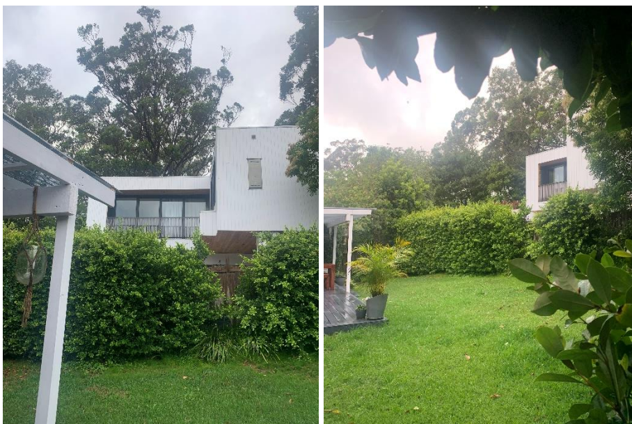
Images showing 94 Park Street looking directly onto the proposed development property. For reference the existing landscaping (hedge) is approximately 2.5m in height.

This is a property at the rear of a long block developed in 2018 (Source: NBC Planning Portal) with two dwellings (94 & 94a) built on the original land. 94 Park Street adjoins the proposed development property to the east on the rear fenceline of the proposed development property. The height and design of 94 Park Street has significant privacy implications to the rear of the proposed development property with an approximately 4m long full height sliding door/window and balcony (on the first floor) looking directly onto the rear of the proposed development property.