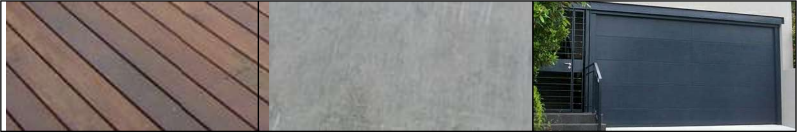
DE. DECKING TIMBER DECK SPOTTED GUM DR.DRIVEWAY CONCRETE DRIVEWAY SMOOTH FINISH GAR GARAGE DOOR ALUMINIUMUM MATT FINISH