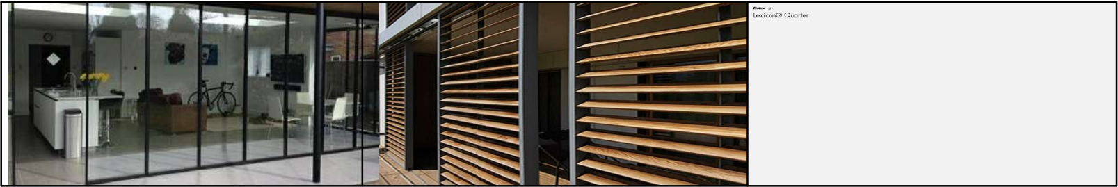
FR. FRAMES POWDER COATED MOUNMENT SC. SCREENS ALUMINIUM OR ALUMINIUM (TIMBER) BATTENS MONUMENT FEN. FENCE TO MATCH RL. - RENDERED LIGHT