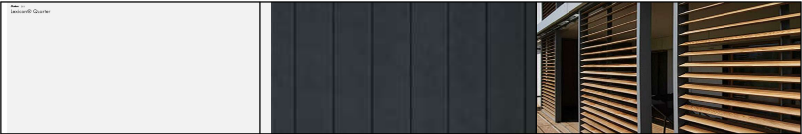
RL. RENDERED LIGHT LEXICON QUARTER RL - LEXICON QUARTER (RENDERED LIGHT) RD.RENDER - DARK SCYON AXON HORIZONTALLY CLADDED MONUMENT BL. BALUSTRADES ALUMINIUM OR ALUMINIUM (TIMBER) BATTENS MONUMENT