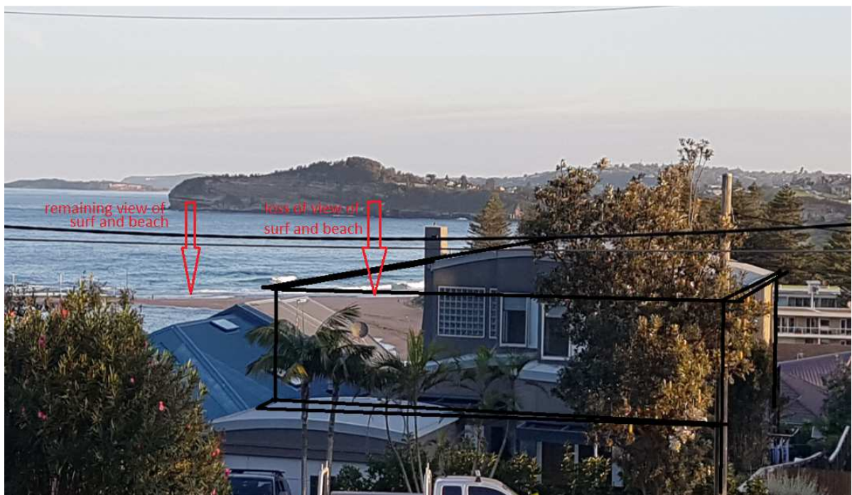
Image 2 - Indicative outline of proposed additions at front of 37 Grandview Pde, demonstrating complete loss of view of the beach and surf break from 48 Grandview Pde

View impact - The proposed additions extend the first storey forward / north to the rear of the existing garage while retaining the existing eave height of the existing first storey. This has the effect of blocking half of the existing view to the beach and surf break from No.48. Refer to Image 2 below depicting this impact. Clearly this demonstrates that the proposal does not comply with the DCP's view sharing control.