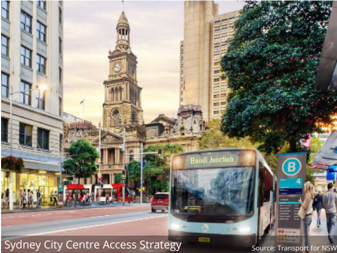
Sydney City Centre Access Strategy