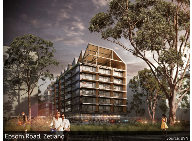
Epsom Road, Zetland