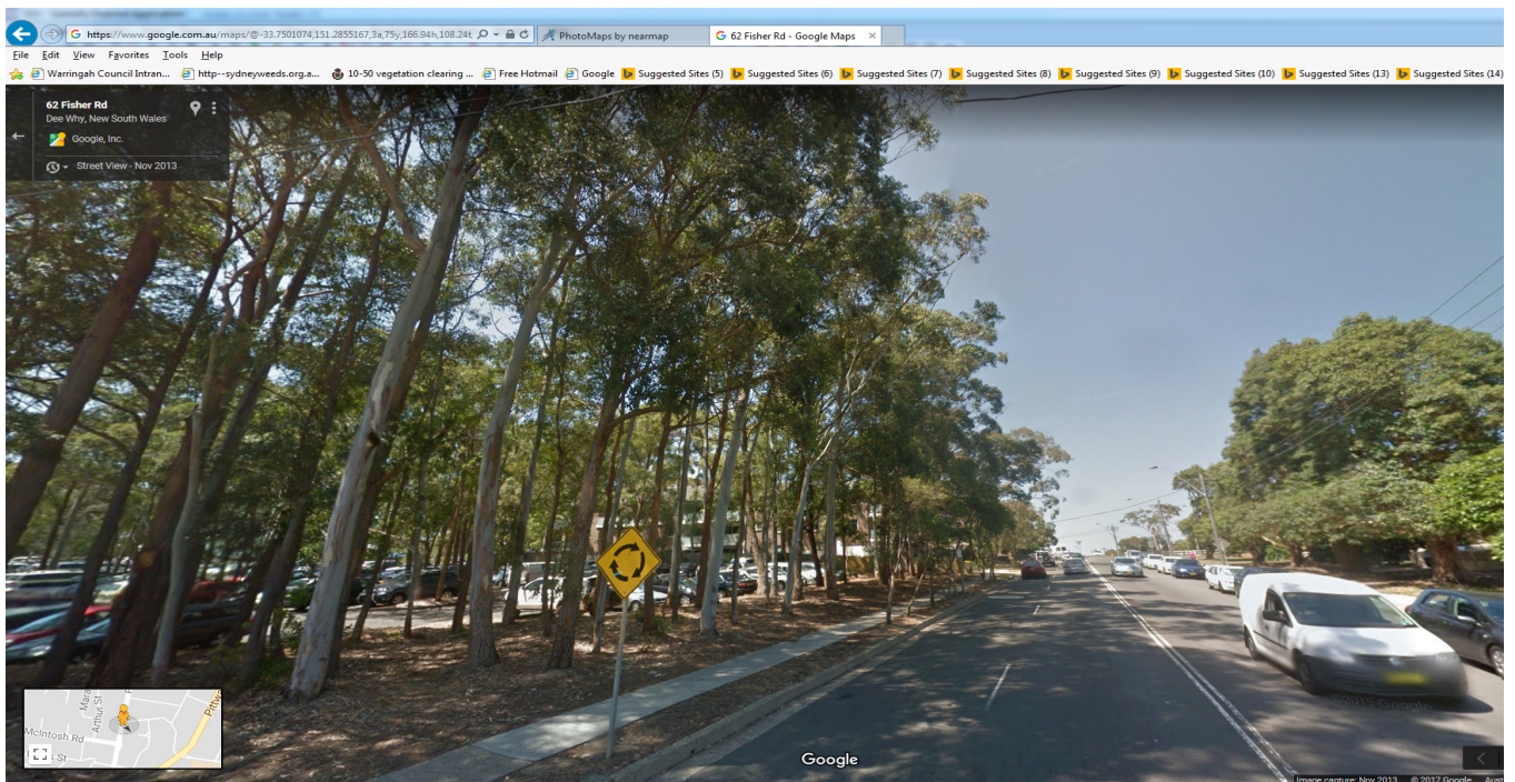
Photo 1 - Pre-construction streetscape, Fisher Rd.