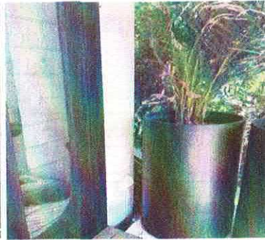
BLACK GRP PLANTERS