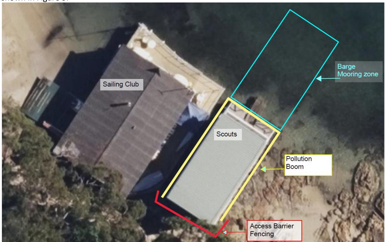
Figure 3 – Site set up

The temporary fence panels will then be erected to restrict access to the works area. A pollution boom will be installed to prevent debris from entering the harbour. The general set up of the site is shown in Figure 3.