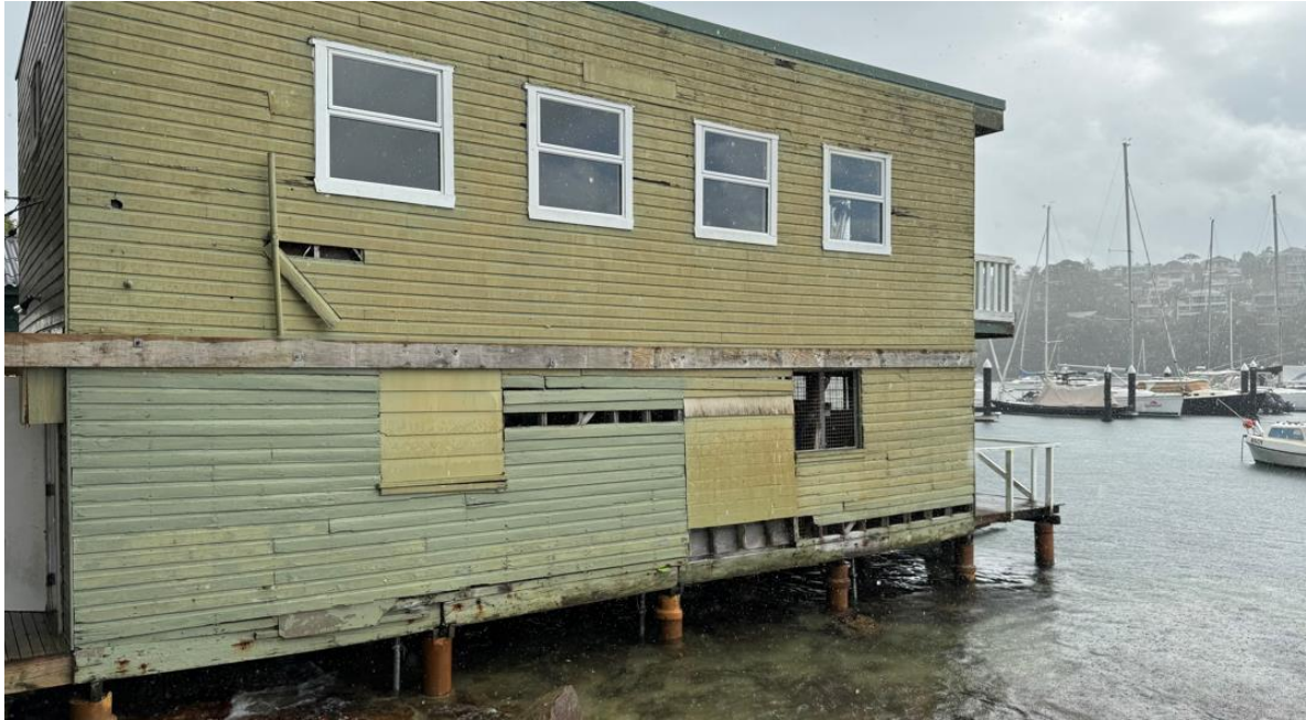
Figure 2 – Existing building