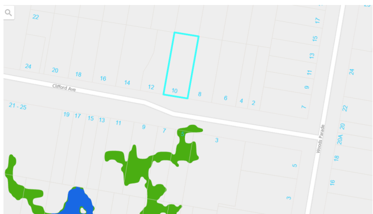
Extract of Council Flood Hazard Map