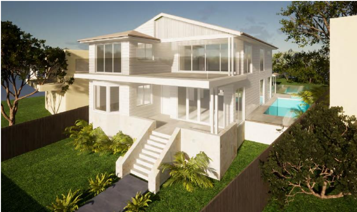
Artists Impression of the Proposed Development

The existing separation between dwellings coupled with the improvements contained within the existing dwelling footprint will ensure that privacy and overshadowing issues are well resolved.