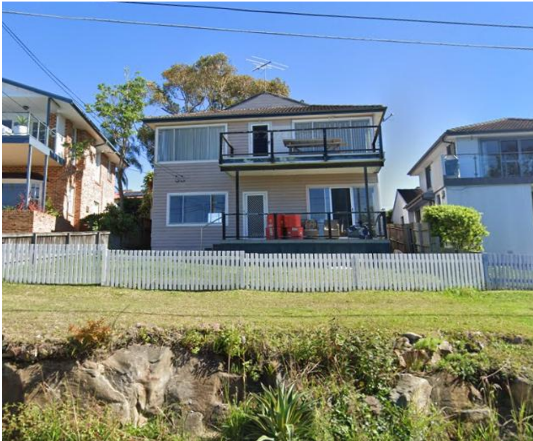
View of the adjoining northern dwelling

The proposed works will not obstruct views as they are contained within the existing dwelling footprint with no proposal to increase the height of the dwelling.