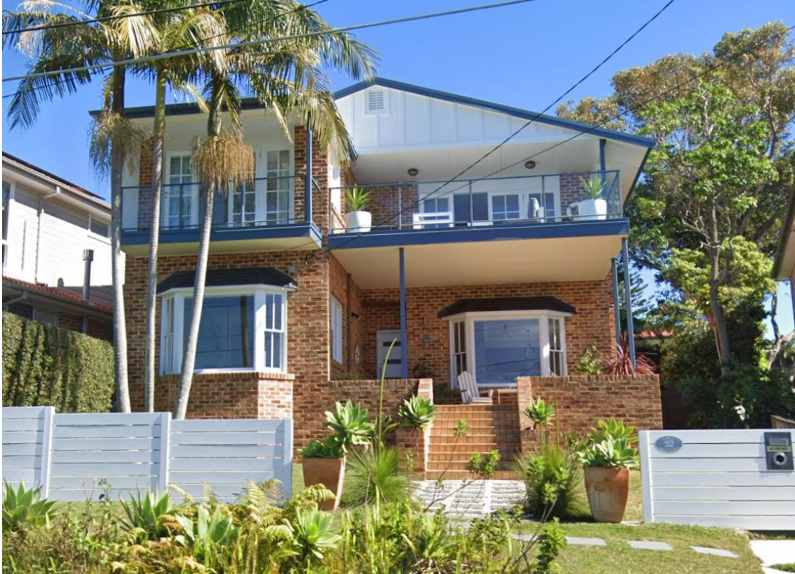
View of the existing dwelling

A sewer main traverses the property adjacent to the northern side boundary. The existing sewer main will require concrete encasing to allow for the construction of the proposed swimming pool over it. An easement for drainage runs across the front yard of the property seemingly in favour of the adjoining dwelling to the south.