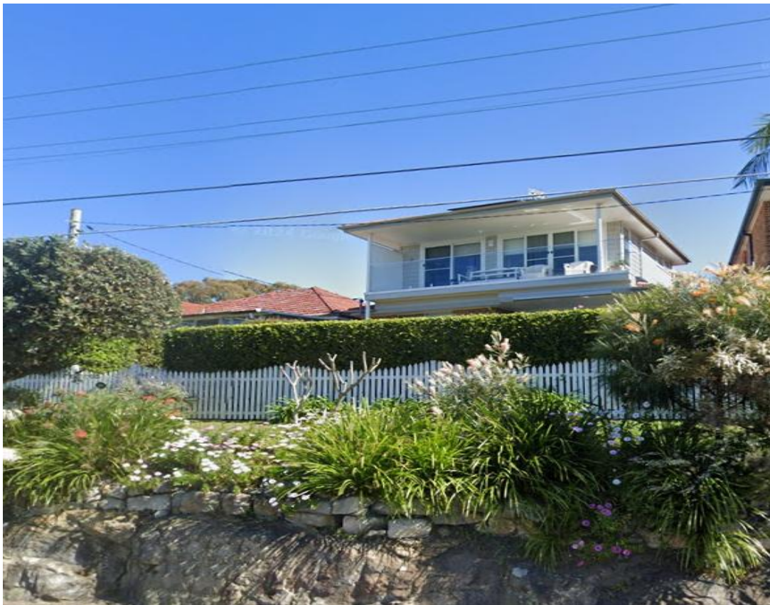
View of the adjoining southern property