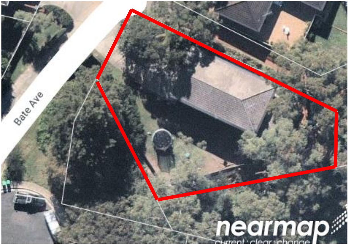
Figure 1: The subject site outlined in red.