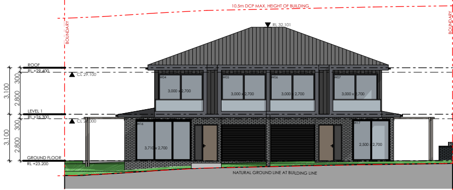
3 NORTH ELEVATION 1:250