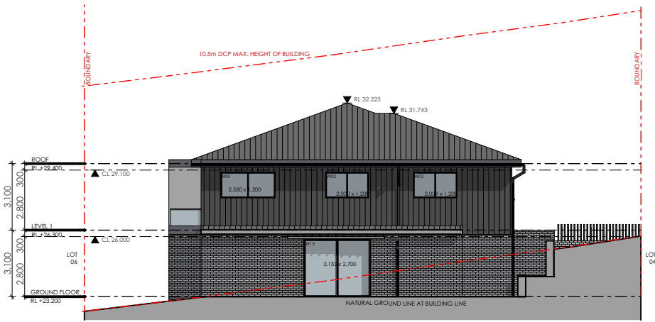
1 WESTELEVATION 1:250