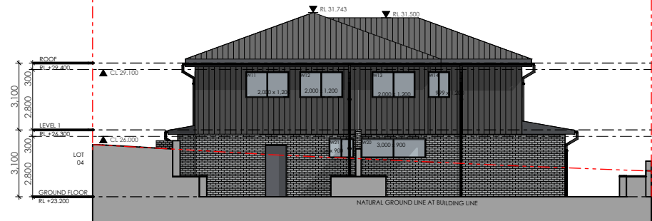
4 SOUTH ELEVATION 1:250