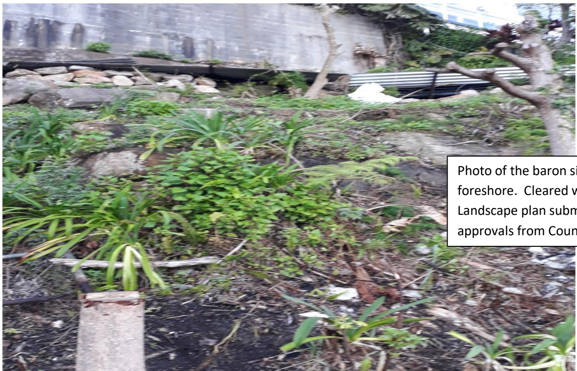
Photo of the baron site on harbour foreshore. Cleared without Landscape plan submitted, or any approvals from Council.

Following the DA submissions you will see that there was no request for a plan or a biodiversity report over this important parcel of harbour front land. Rather, the reports were done, post clearance, and post my second objection, highlighting what the owners had done to this land.