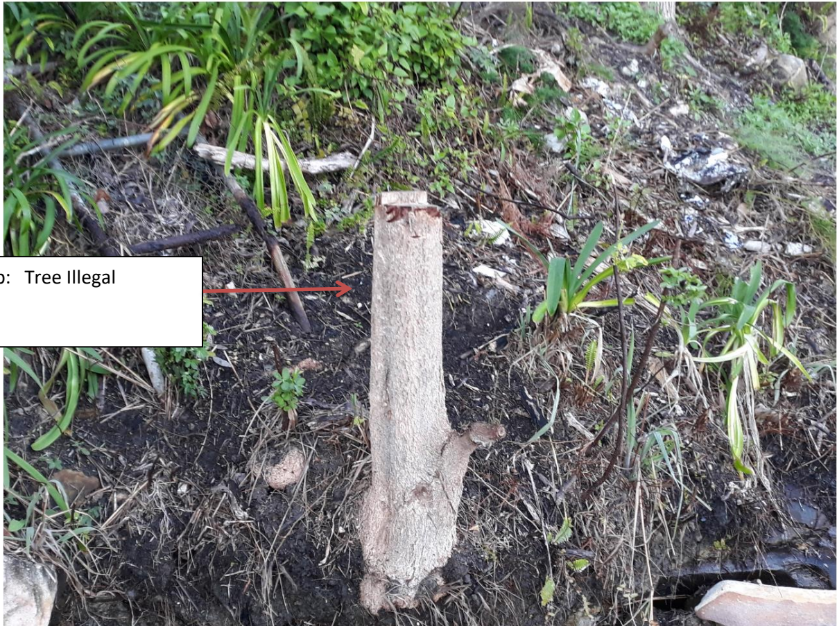
She oak stump: Tree Illegal removal.