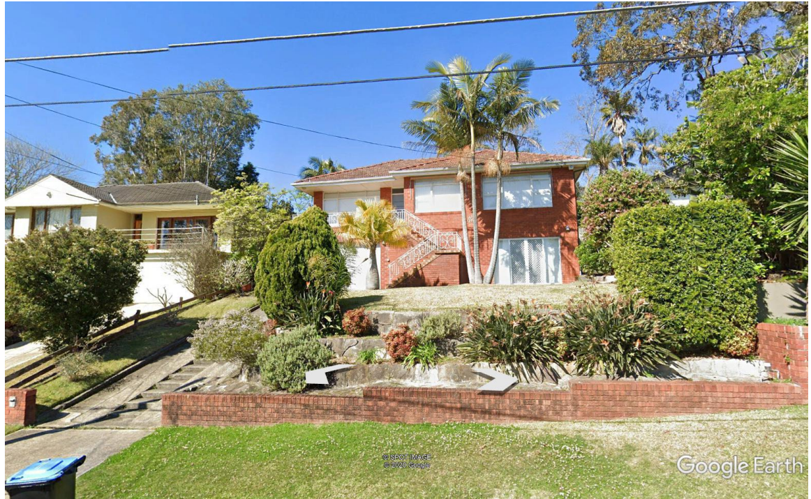
Adjoining northern property - No 9 Bimbadeen Crescent

Reasonable measures are also taken to protect the privacy of this adjoining neighbour by proposing no windows in the southern side upper elevation. Outlook from the proposed upper level is directed to the rear yard and road rather than to the south.