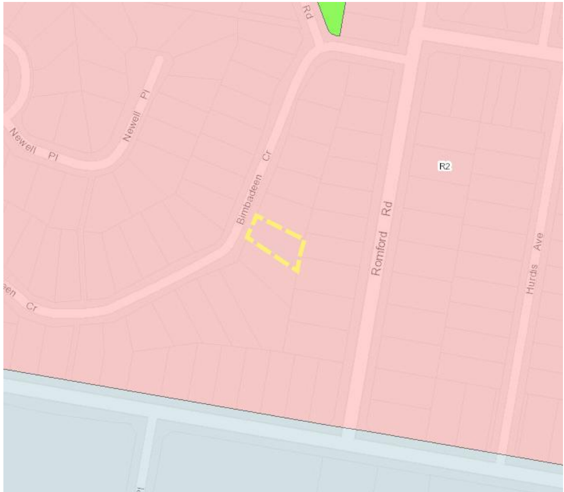
Land Zoning Extract – R2 Low Density Residential

The subject land is zoned R2 Low Density Residential pursuant to Warringah LEP 2011.