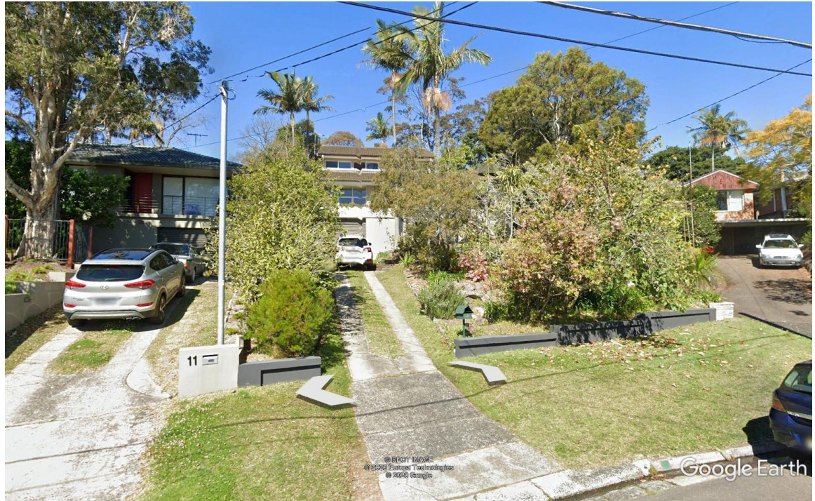
View of No 13 Bimbadeen Crescent

The adjoining dwelling maintains a substantial setback from the common boundary and presents a three level elevation to the street. The proposed upper level addition on the subject site is well set inwards from the common boundary so as to maximise the separation between dwellings and minimise overshadowing affectation of the adjoining southern property.