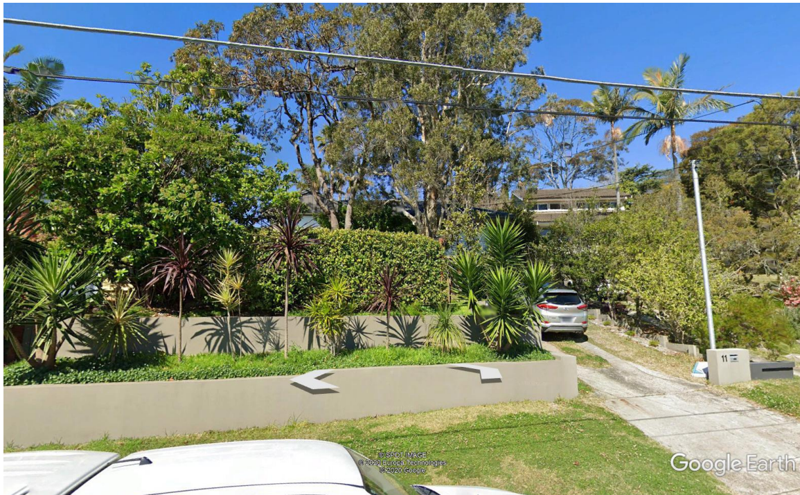
View of the existing dwelling on the Subject Site

The building is not listed under the Warringah Local Environmental Plan 2011 as having any heritage significance nor is it in the immediate vicinity of any items of heritage significance.