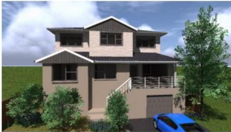
Proposed Streetscape elevation