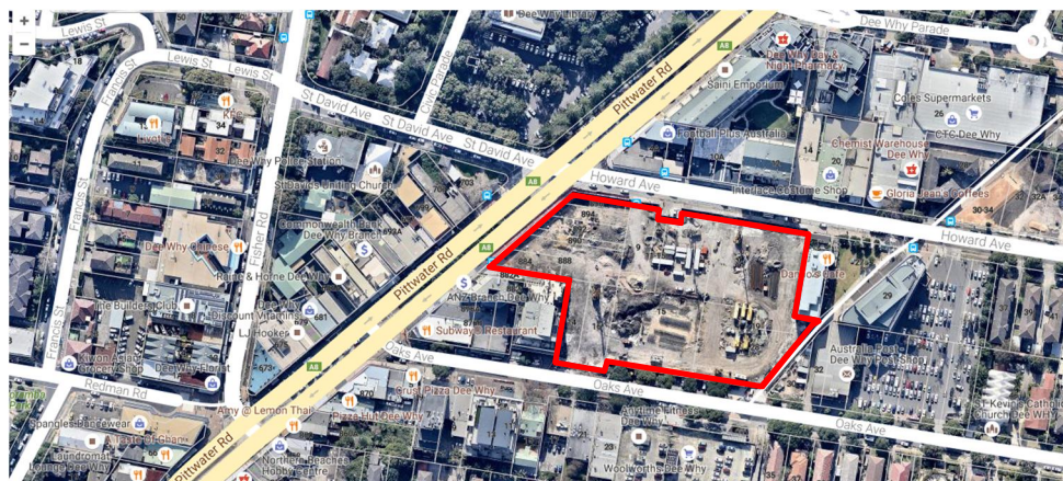
Figure 2: Aerial view of subject site - outlined in red