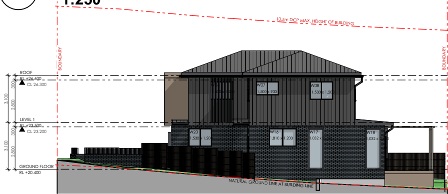
03 EAST ELEVATION 1:250