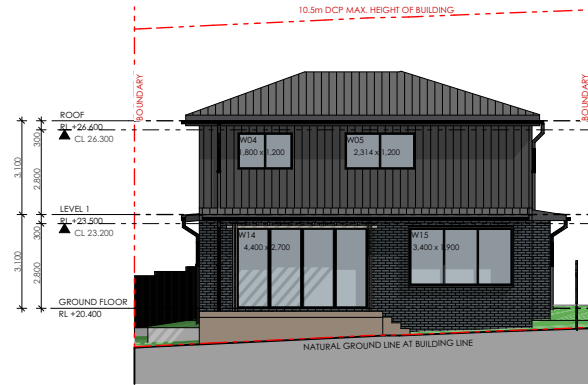
02 NORTH ELEVATION 1:250