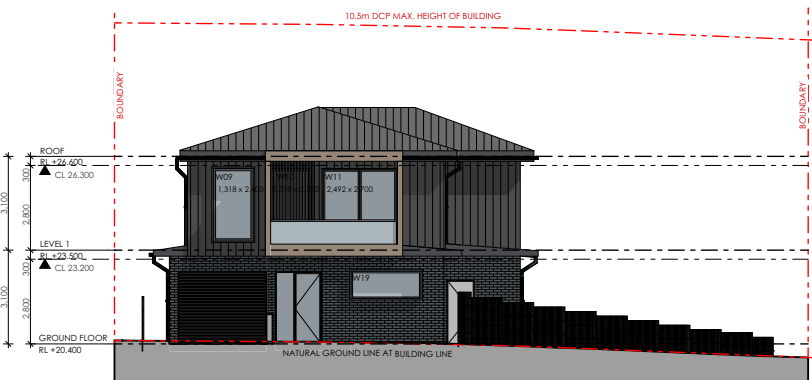
04 SOUTH ELEVATION 1:250