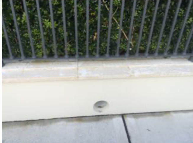
Example of gap under boundary fence for bandicoot access