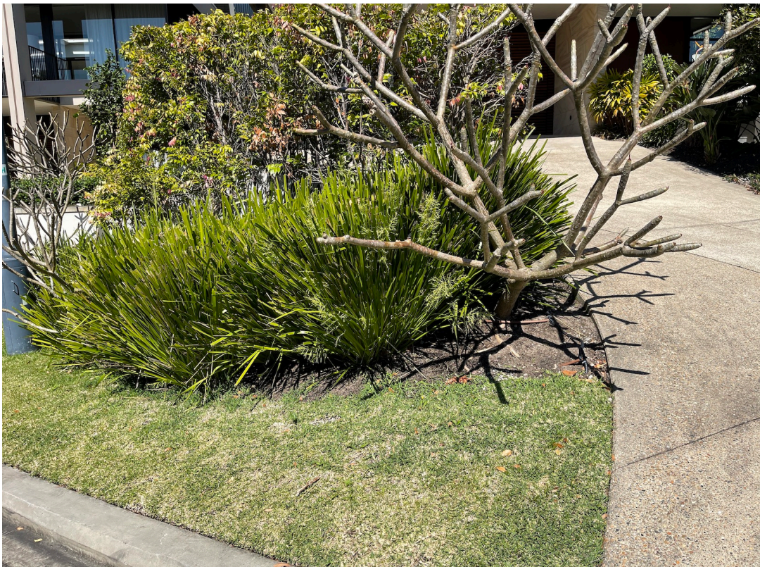
Figure 2 Front yard, looking south-east