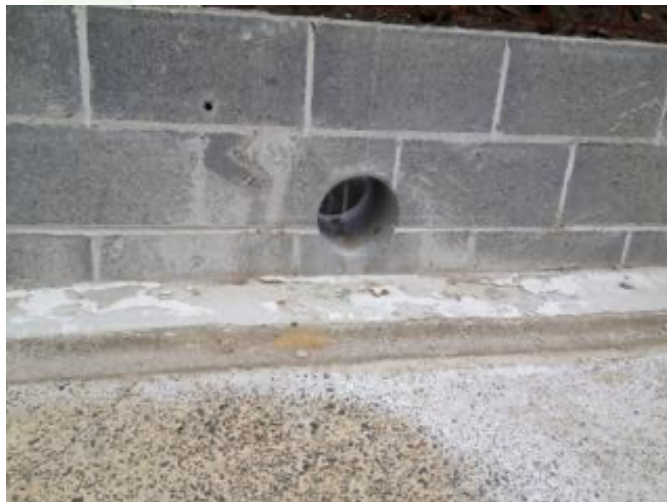
Example of gap under boundary fence for bandicoot access