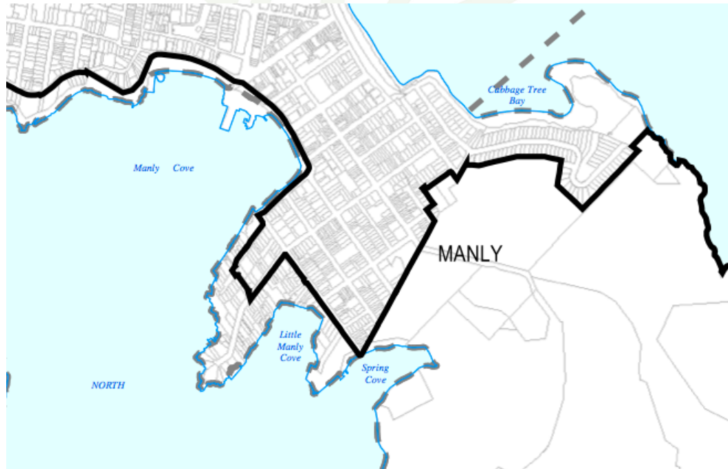
Image: Strategic Foreshores and Waterways Area – Part of Sheet 4 SREP SHC

The area to the south of the heavy black boundary line on the figure below is within the Foreshores and Waterways Area and includes the whole of North Head, St Patrick's Estate, Manly Boatshed and Manly Wharf. See image below. The whole of Manly Cove is zoned as W2 Environment Protection Zone. Wetlands are mapped along the majority of Manly Coves' foreshore.