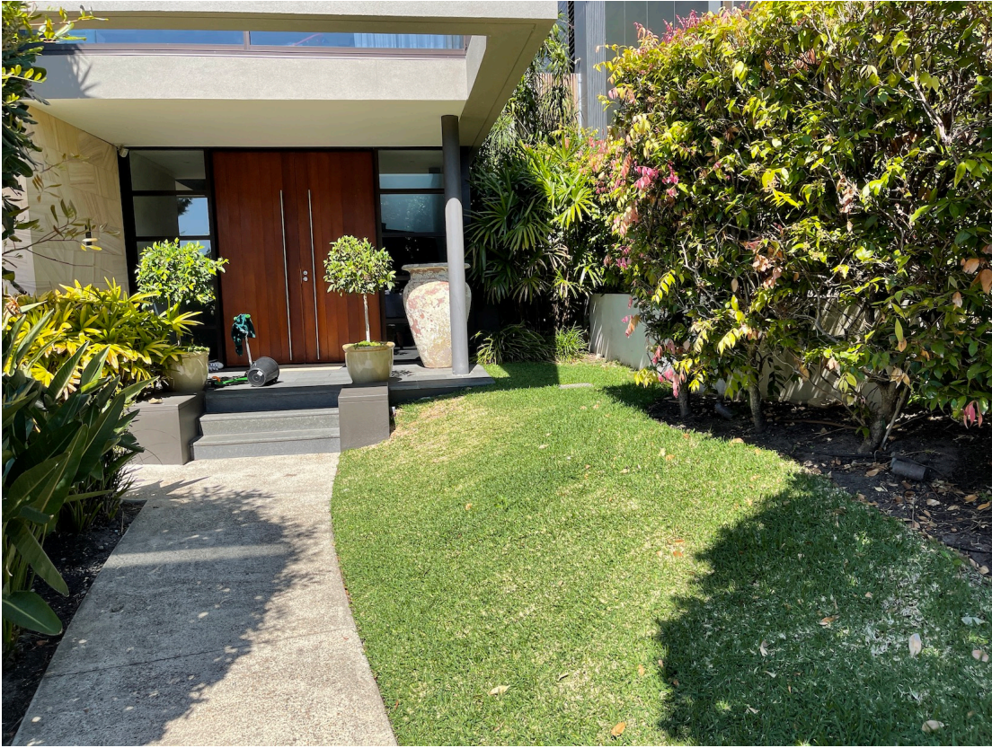
Figure 1 Front yard, looking south-west