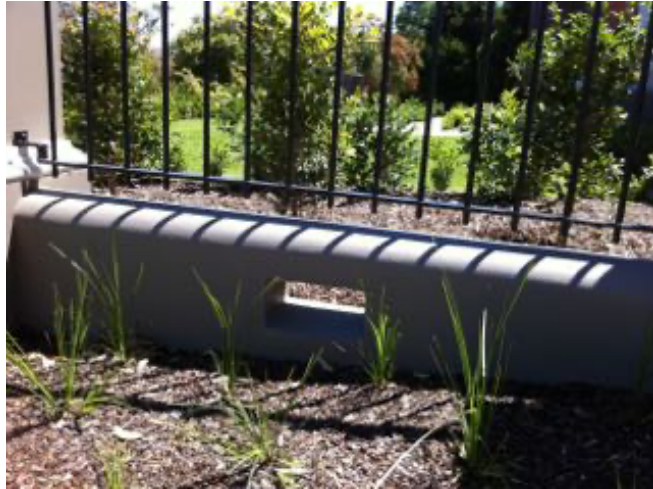
Example of gap under boundary fence for bandicoot access