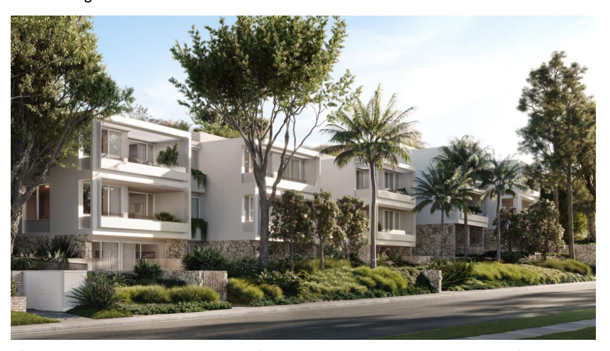
Figure 3 - Photograph montage of proposed development as viewed from Beaconsfield Street confirming that the non-compliant lift overruns will not be readily discernible in a streetscape context with the overall height, bulk and scale consistent with that established by the immediately adjoining residential flat building