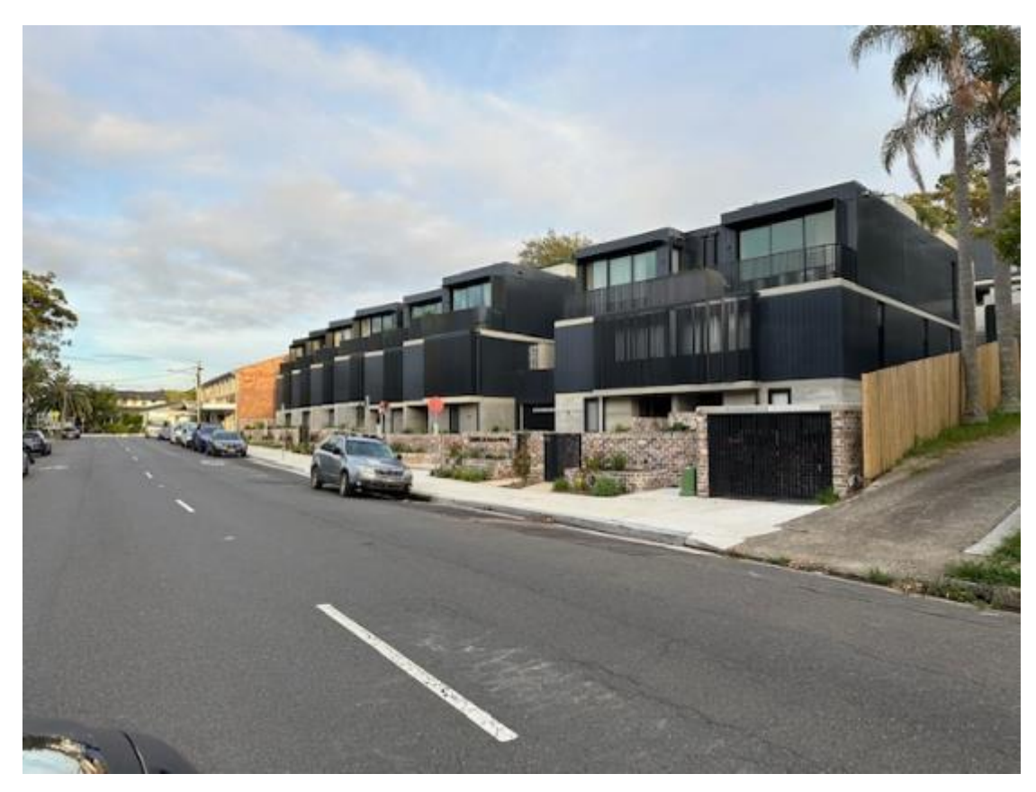
Figure 2 - Photograph of recently completed western adjoining residential flat building 60 Beaconsfield Street