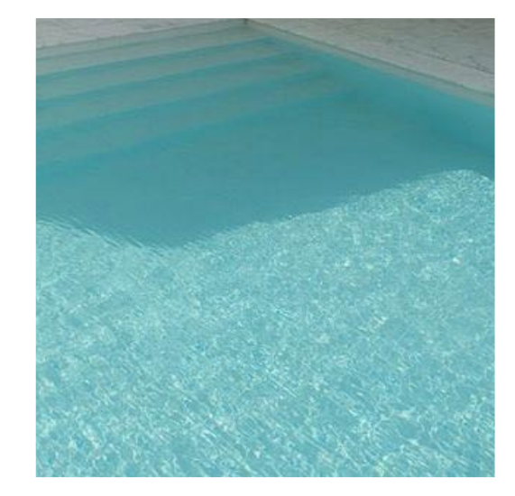
Swimming pool - propopsed site feature