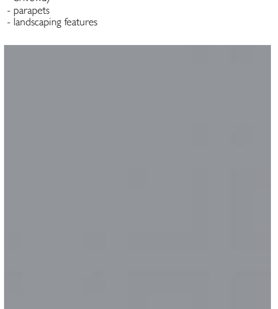
Colorbond Windspray - roofing - gutters - downpipes