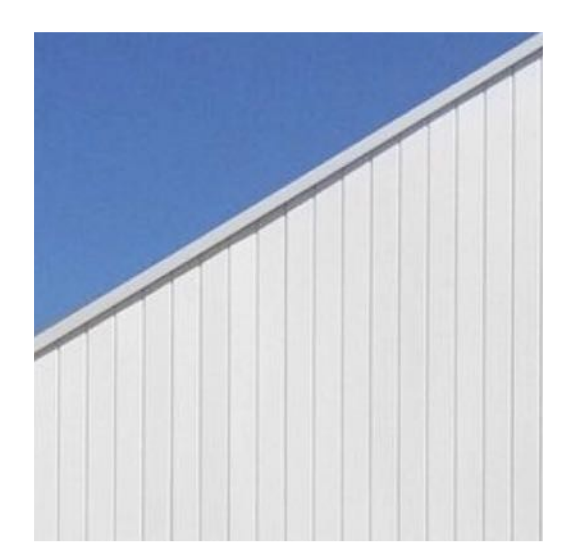
Timber cladding - upper level - DULUX Grey Pebble or similar