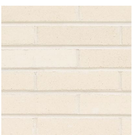
- dwelling - Bowral Bricks Chillingham White or similar