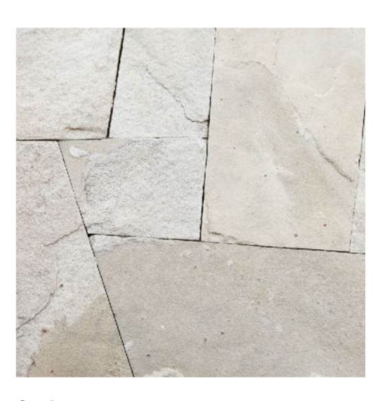
Sandstone - dwelling cladding - landscaping features