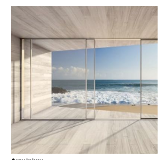
Auminium external windows and doorsselect powdercoat finish