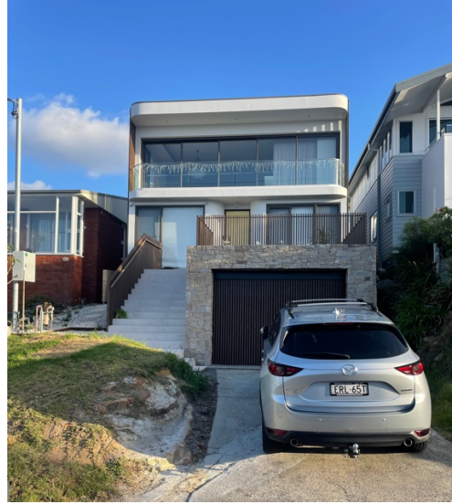
No. 6 Austin