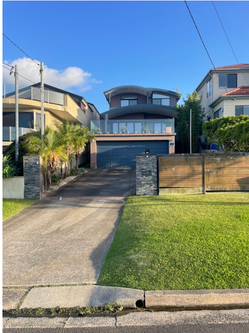
No. 46 Austin