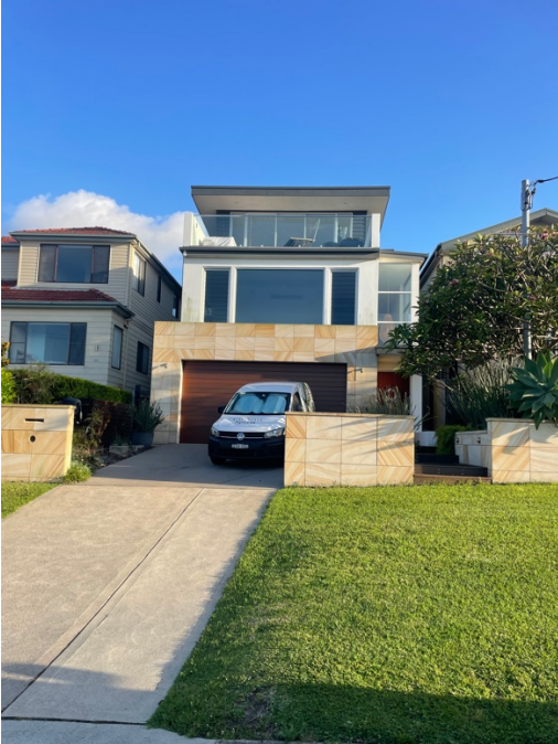
No. 42 Austin