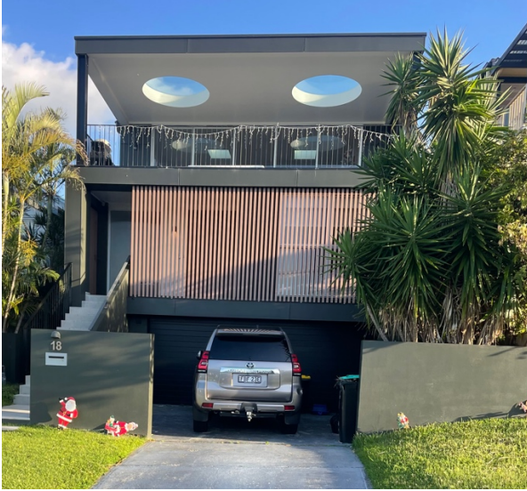
No. 18 Austin