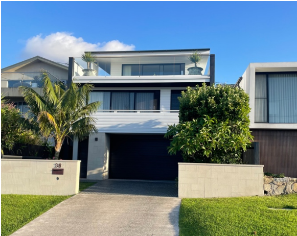
No. 38 Austin