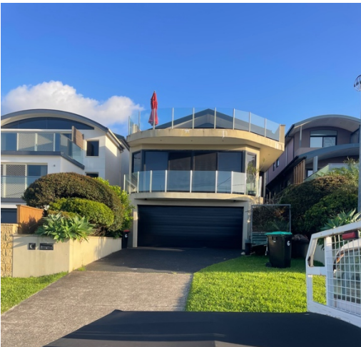
No. 48 Austin

(b) to minimise visual impact, disruption of views, loss of privacy and loss of solar access,