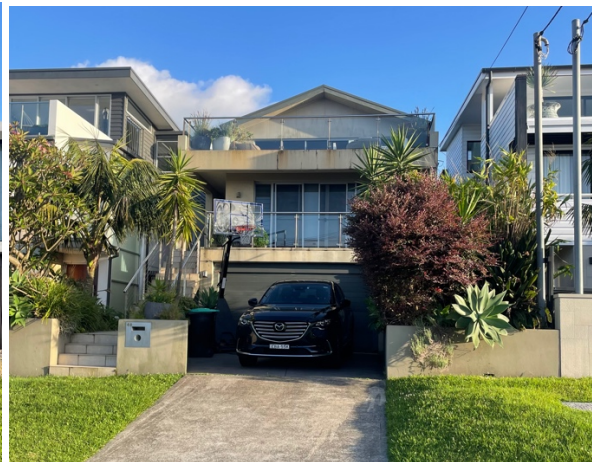
No. 40 Austin