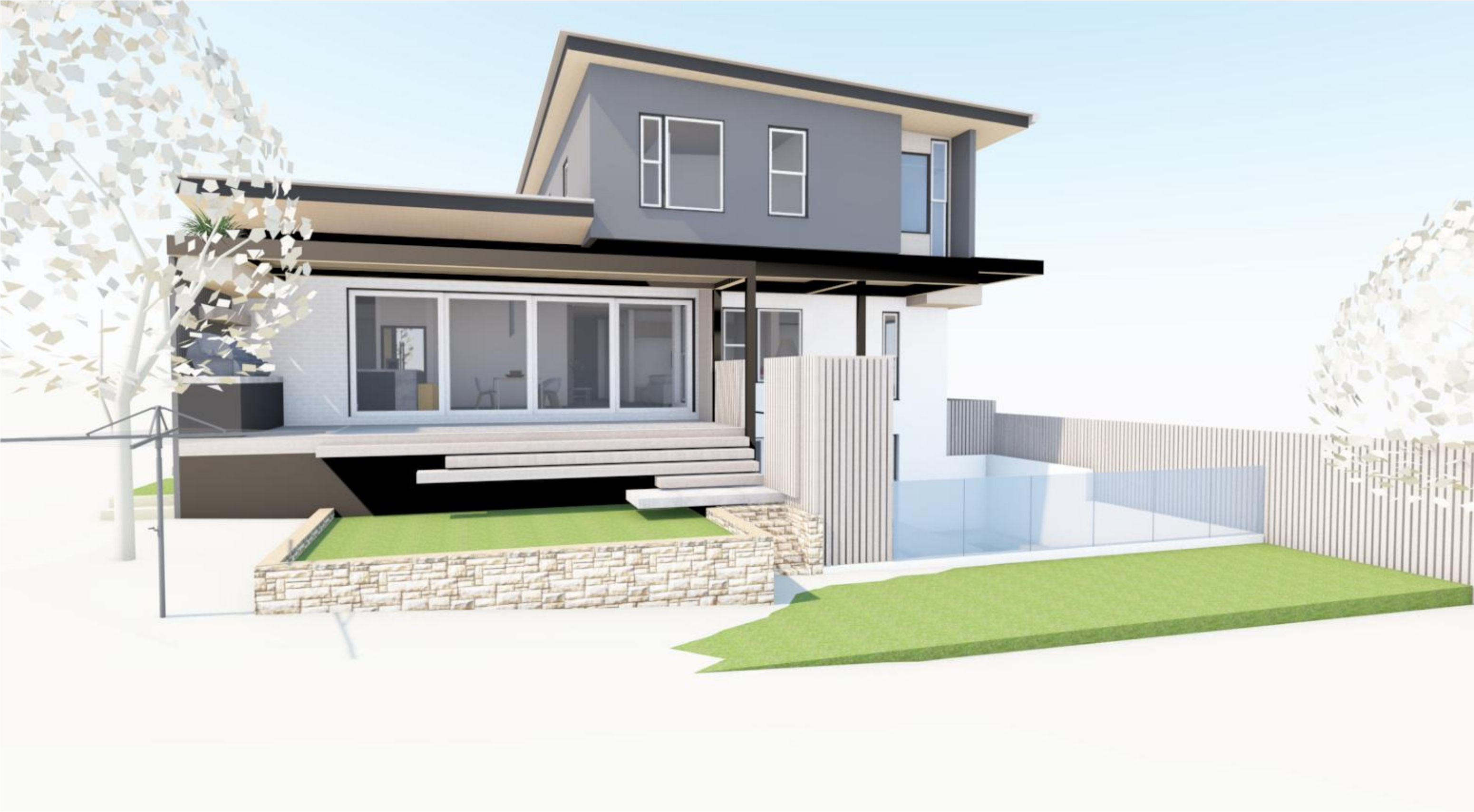
OVERALL REAR VIEW