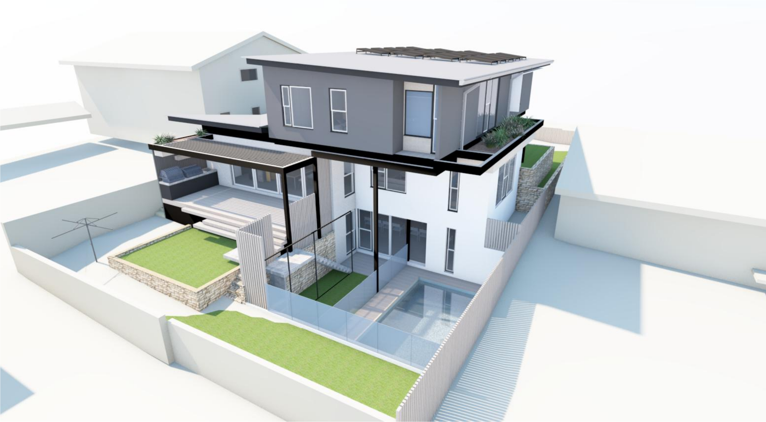
REAR VIEW OVER POOL