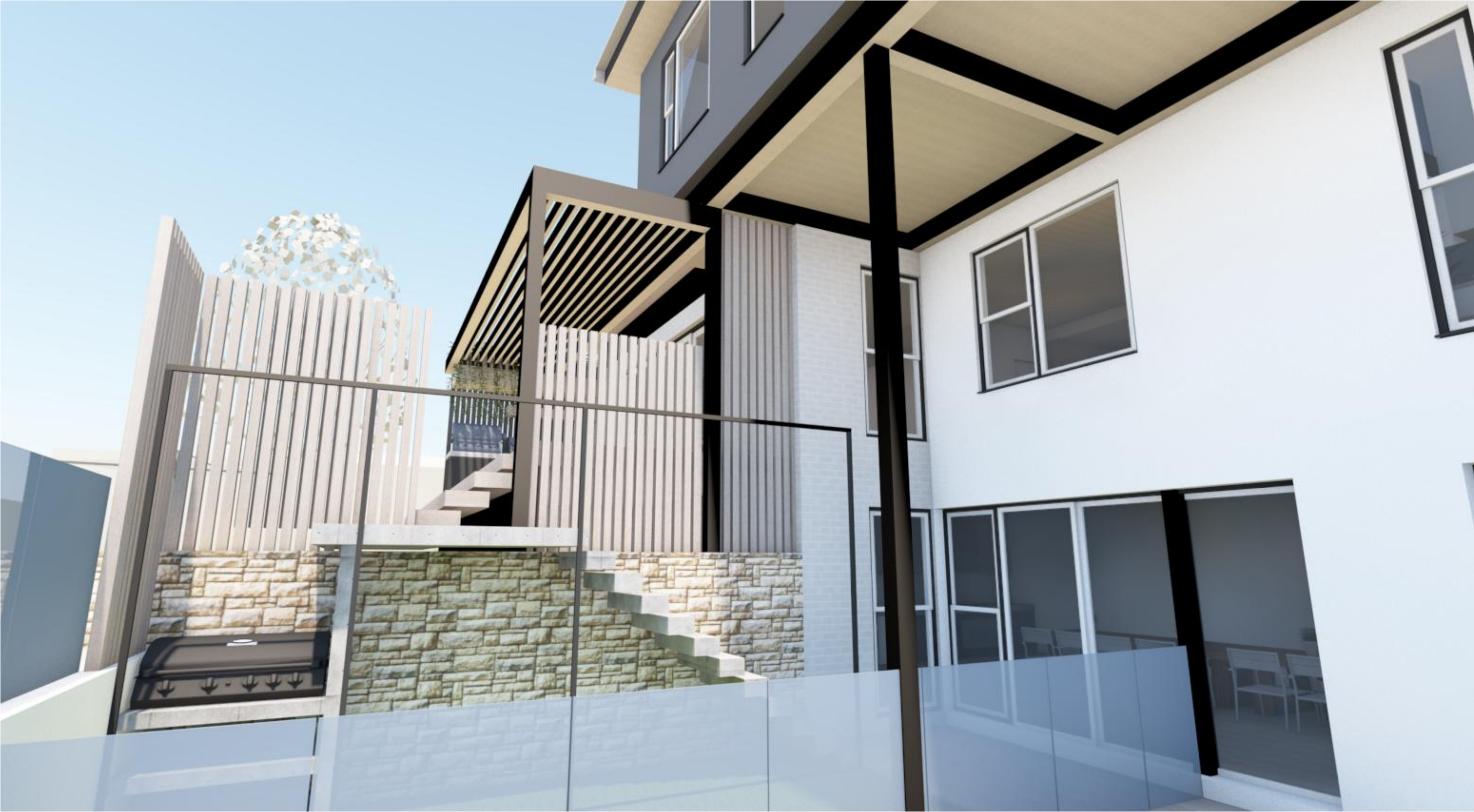
VIEW FROM POOL UP