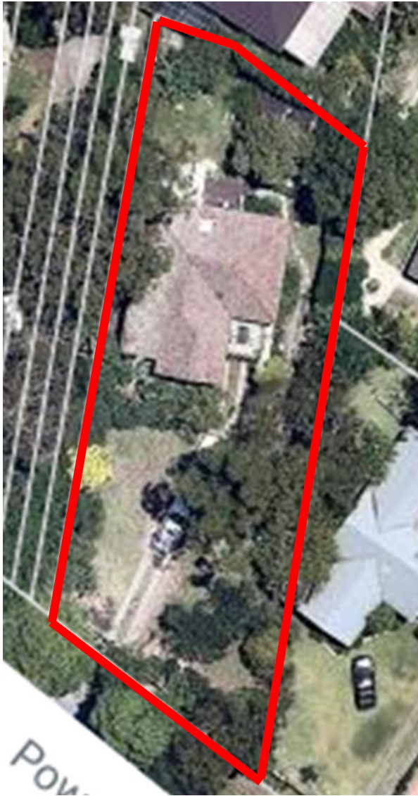
Figure 1: The subject site outlined in red ( nearmap 2019 ).