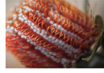
6 Banksia integrifolia