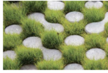
3 Grass pavers