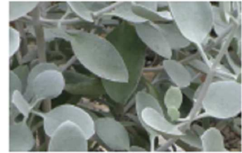
9 Crassula Arborescens Silver Dollar Plant