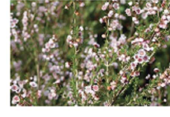
7 Dwarf thryptomene Payne's Thryptomene