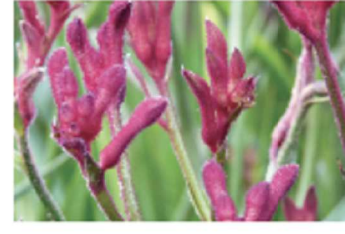
5 Anigozanthos Kangaroo paw