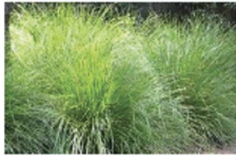
1 Lomandra longifolia spiny-head mat-rush