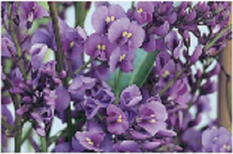
10 Hardenbergia Happy Wanderer