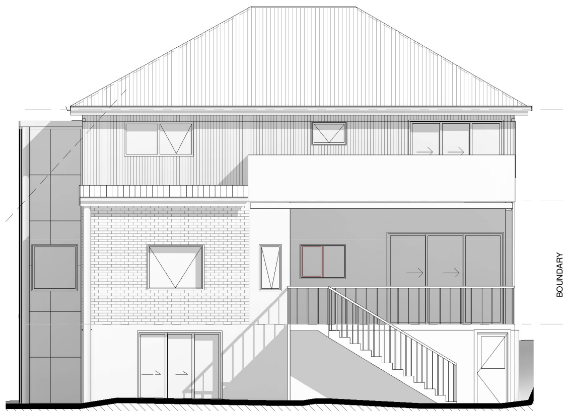
3 South Elevation