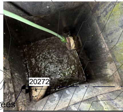
Photo: testing Storm water pit with hose