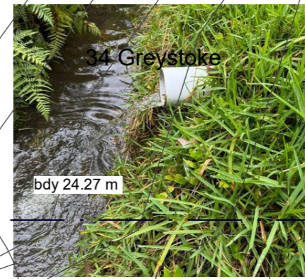
Photo: hose water runs into creek below house