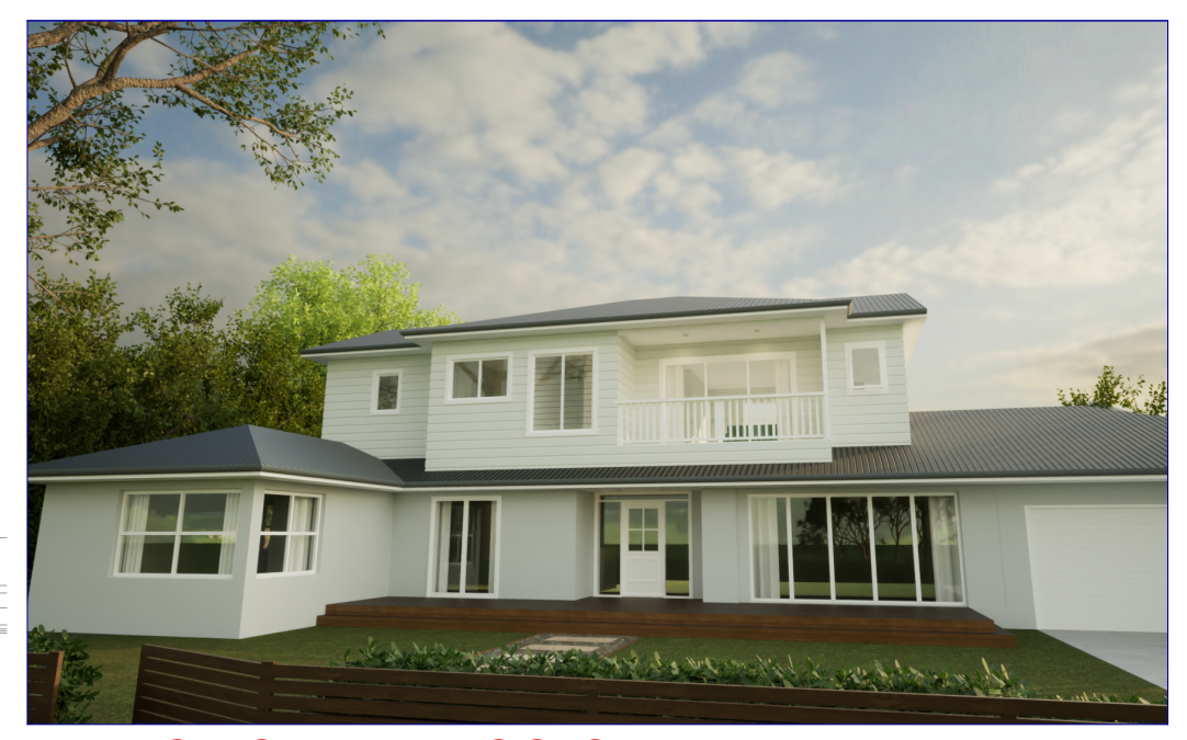
ARTIST'S IMPRESSION FOR ILLUSTRATION PURPOSES ONLY. NOT TO BE READ AS A WORKING DRAWING