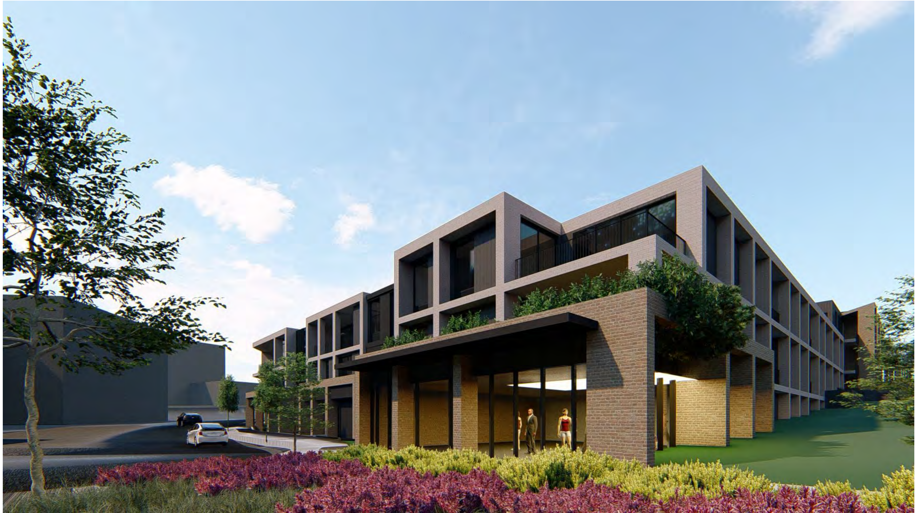
Photomontage View Along Glenrose Pl / Ashworth Ave