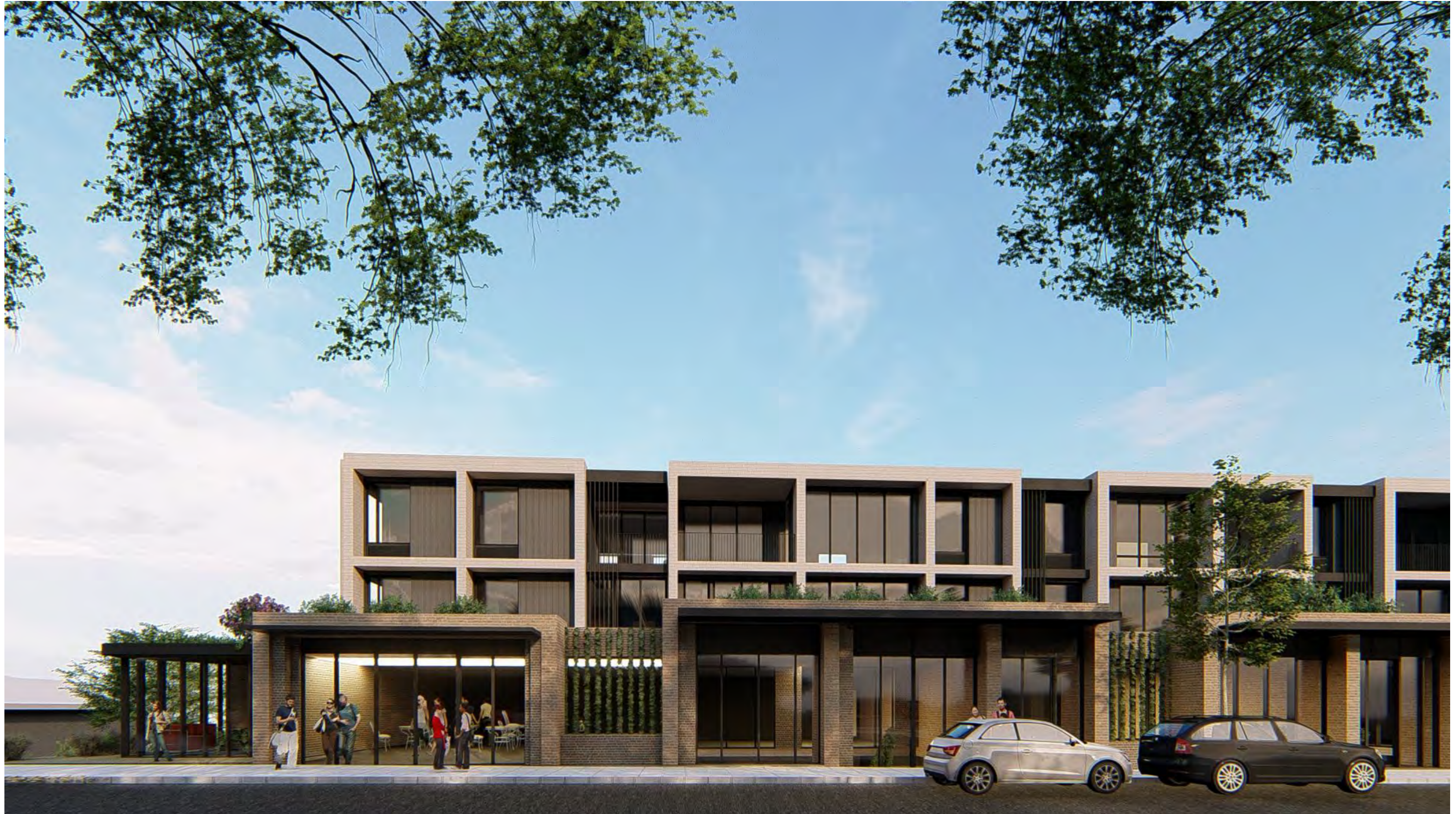
Photomontage View Along Lockwood Avenue