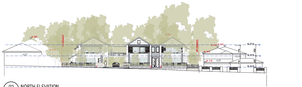
02 NORTH ELEVATION NTS