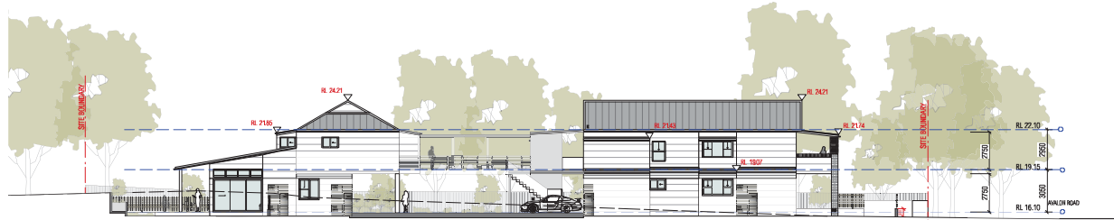
03 EAST ELEVATION NTS