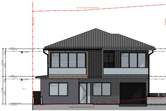
1 WEST ELEVATION 1:250