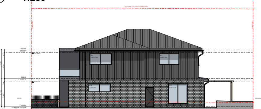
4 SOUTH ELEVATION 1:250