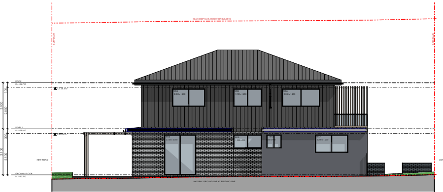
3 NORTH ELEVATION 1:250