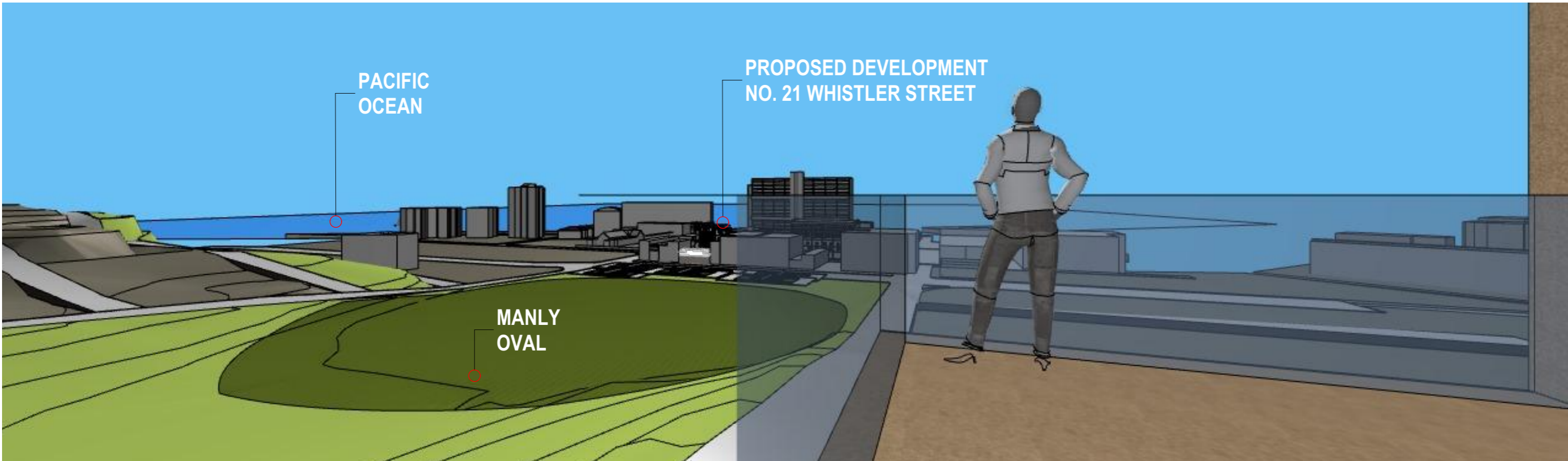
1 Camera View from Roof Top (New)

FIGURED DIMENSIONS ARE TO BE TAKEN IN PREFERENCE TO SCALED DIMENSIONS. THE CONTRACTOR IS TO CHECK AND VERIFY FIGURED DIMENSIONS PRIOR TO ANY COMMENCEMENT OF WORK ON SITE. THIS DRAWING IS COPYRIGHT AND SHALL REMAIN THE PROPERTY OF WOLSKI COPPIN ARCHITECTURE.