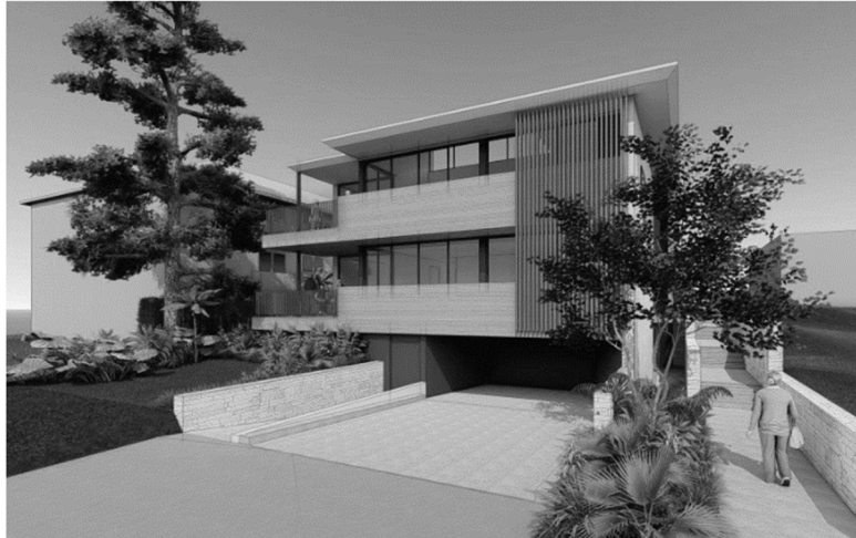
Figure 1 | Proposed Development

The project entails a Seniors Living Development that provides six (6) apartments over two levels with additional basement car parking. Each apartment provides three bedrooms, two bathrooms and open plan living areas.