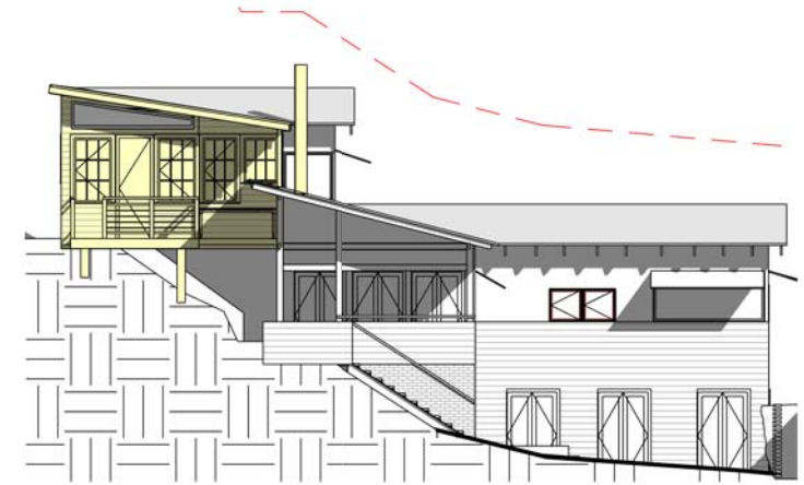
2 NORTH ELEVATION 1 : 200