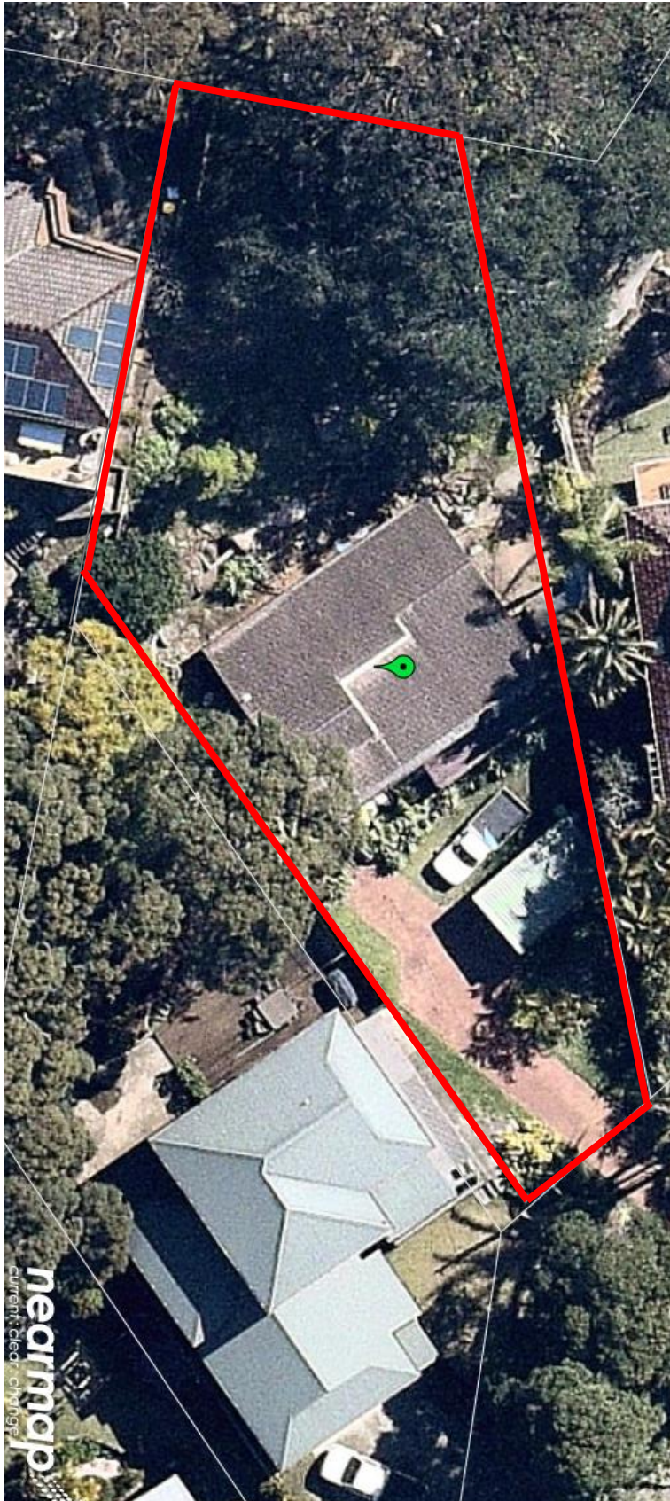
Figure 1: The subject site outlined in red.