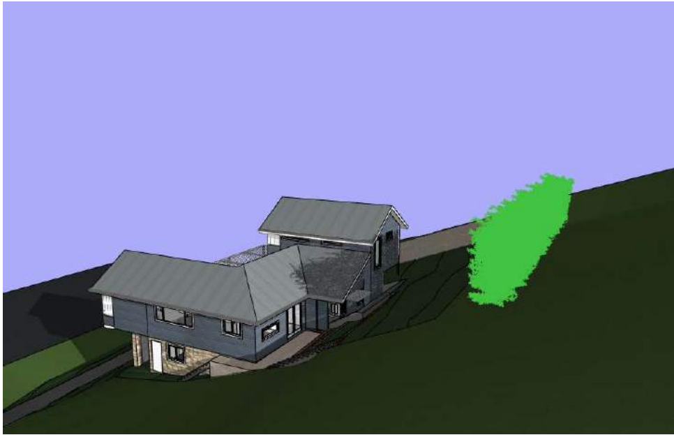
Bamboo - 2m away from boundary 3m high - June 21 - 9am FAR