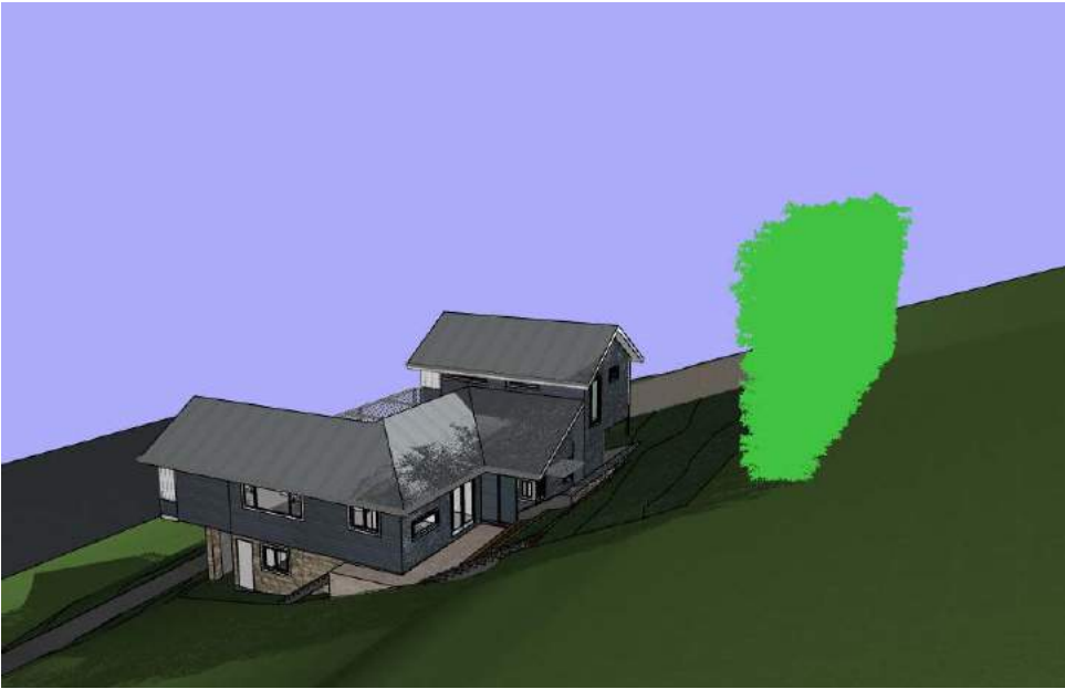
Bamboo - 2m away from boundary 6m high - June 21 - 12pm FAR