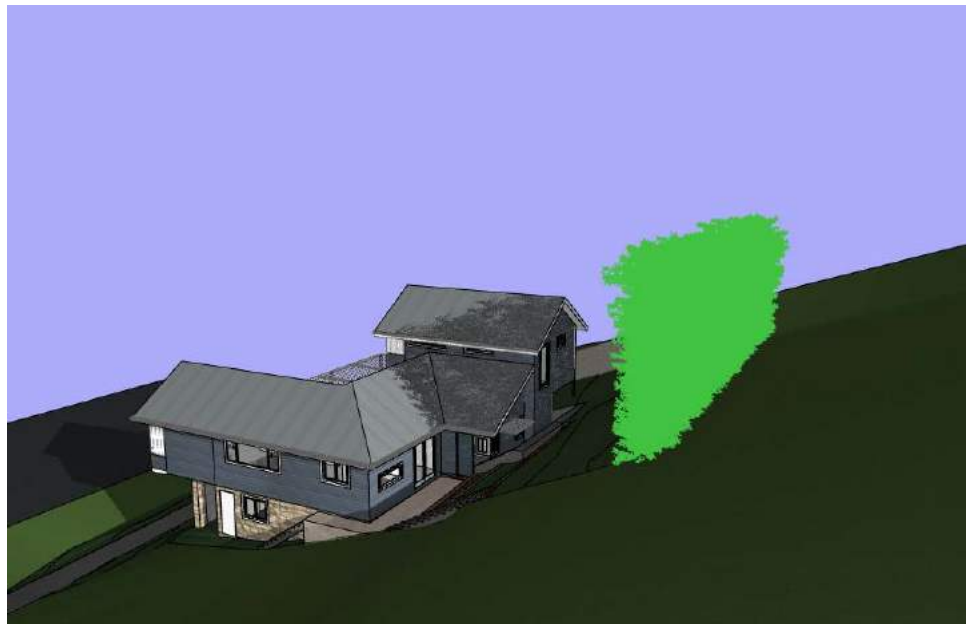
Bamboo on boundary 6m high - June 21 - 9am FAR