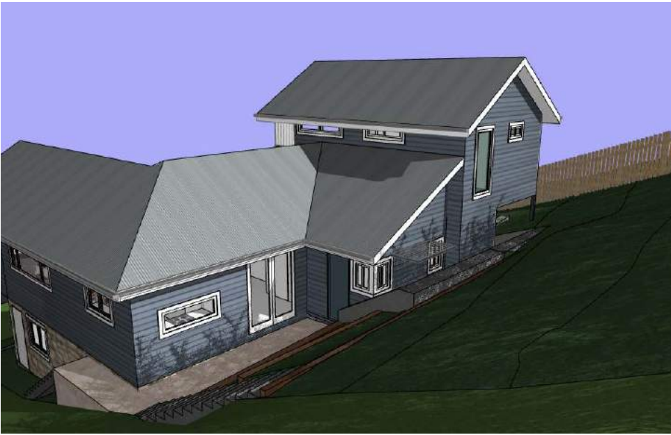
Bamboo - 2m away from boundary 3m high - June 21 - 12pm