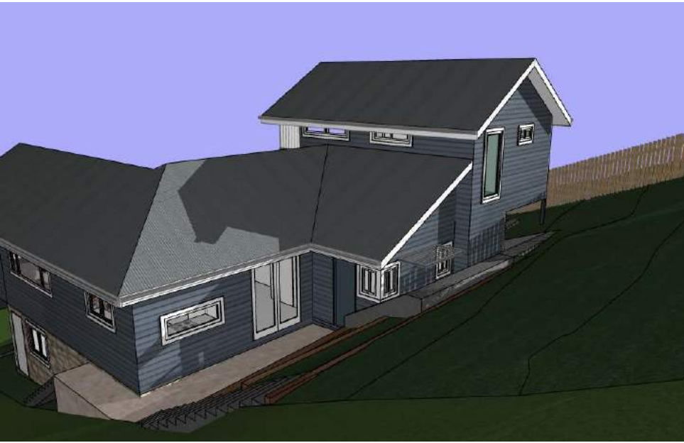
Bamboo - 2m away from boundary 6m high - June 21 - 3pm