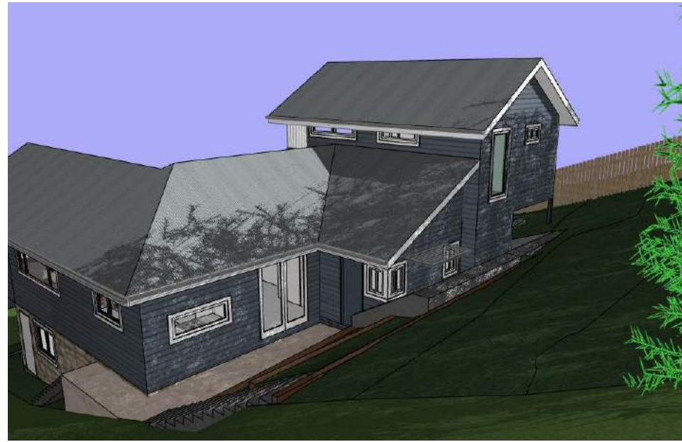
Bamboo on boundary 6m high - June 21 - 12pm