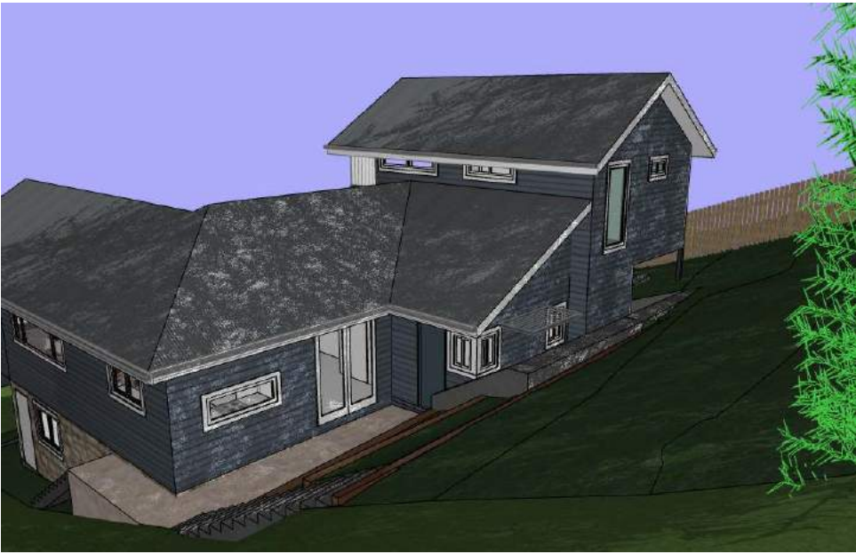
Bamboo on boundary 10m high - June 21 - 12pm