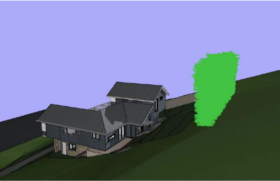
Bamboo - 2m away from boundary 6m high - June 21 - 3pm FAR