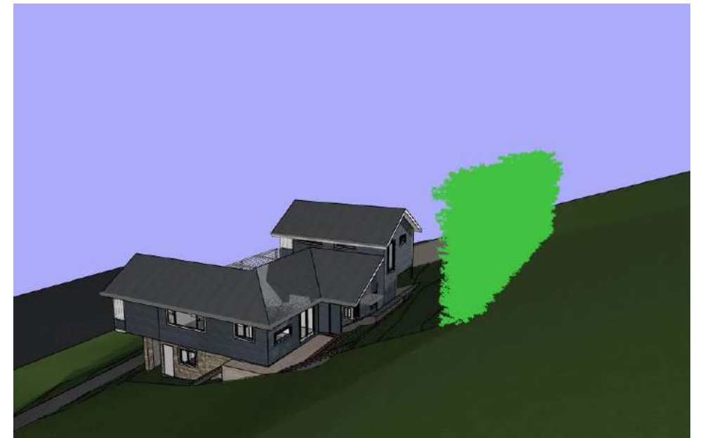
Bamboo on boundary 6m high - June 21 - 3pm FAR