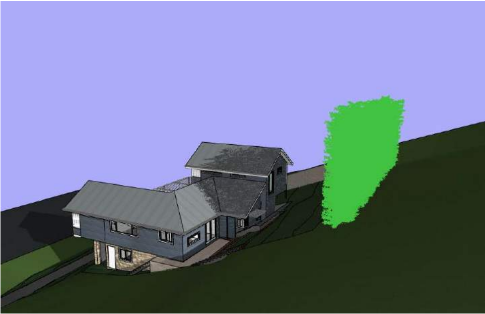
Bamboo - 1m away from boundary 6m high - June 21 - 9am FAR