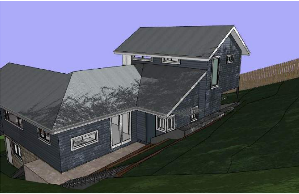
Bamboo - 1m away from boundary 6m high - June 21 - 12pm