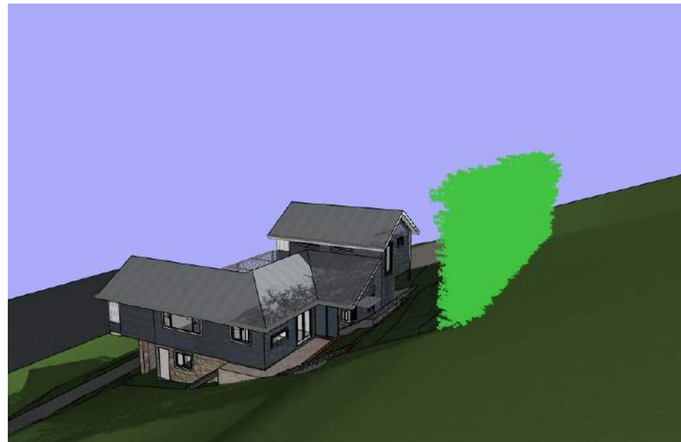
Bamboo on boundary 6m high - June 21 - 12pm FAR