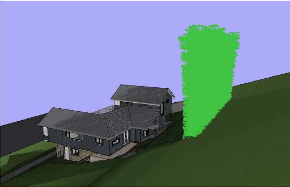
Bamboo on boundary 10m high - June 21 - 12pm FAR