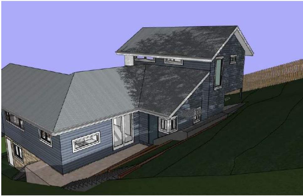
Bamboo - 2m away from boundary 6m high - June 21 - 9am