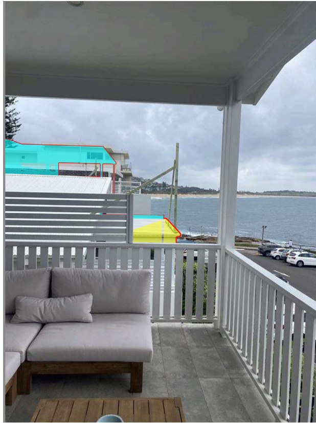
Visual impact in cyan with red outline