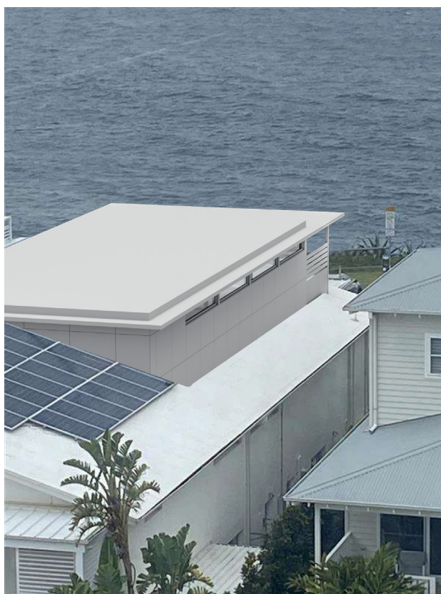
Photomontage of proposal