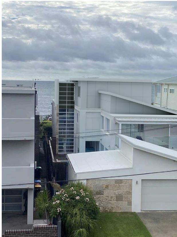
Photomontage of proposal