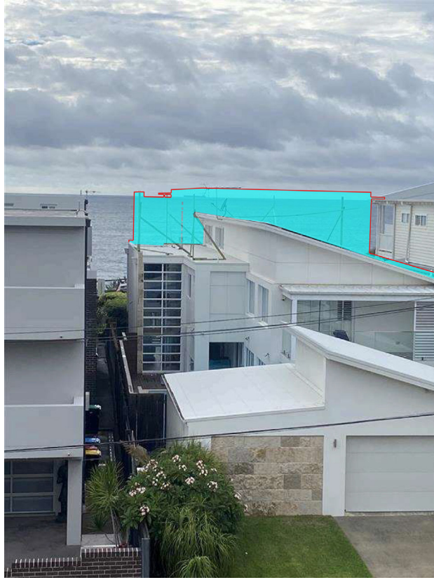
Visual impact in cyan with red outline