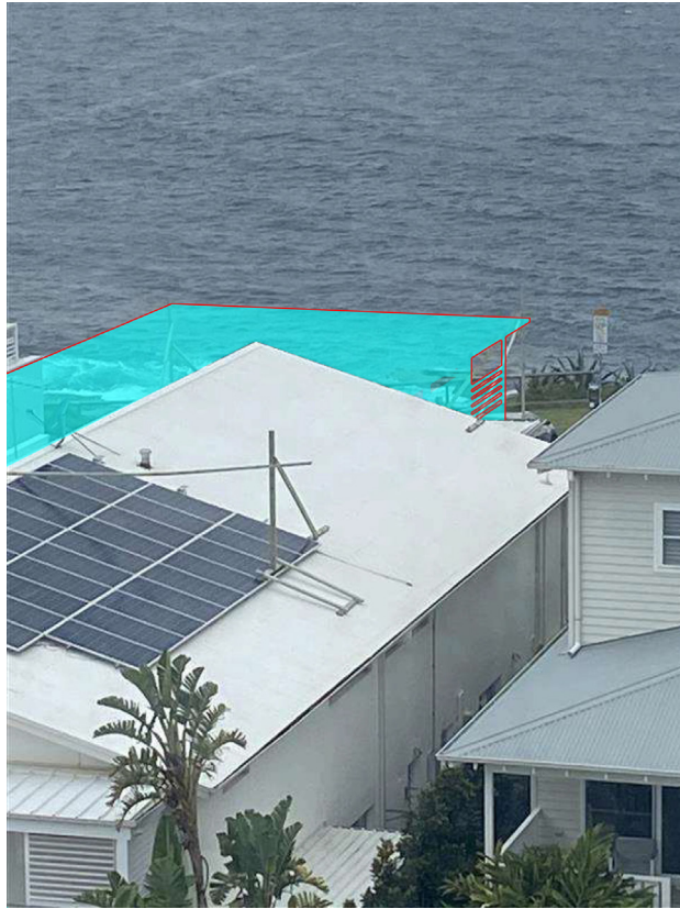
Visual impact in cyan with red outline