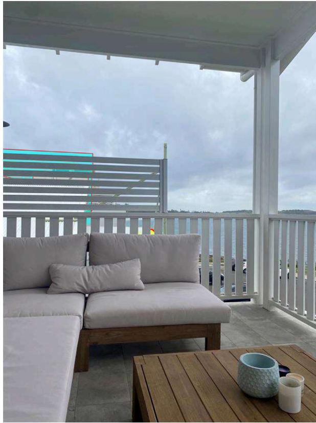
Visual impact in cyan with red outline