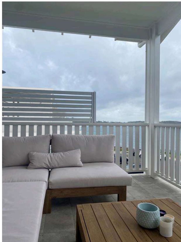
Photomontage of proposal