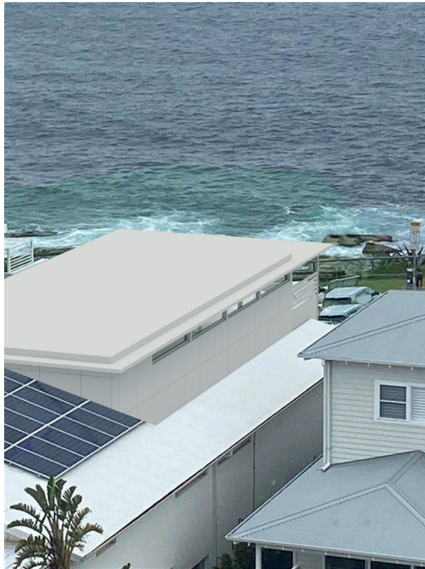
Photomontage of proposal