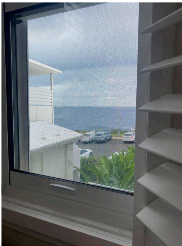
Photomontage of proposal