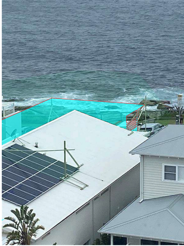
Visual impact in cyan with red outline