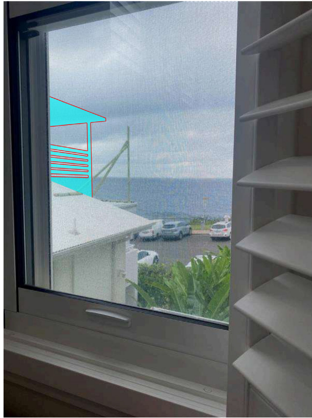
Visual impact in cyan with red outline