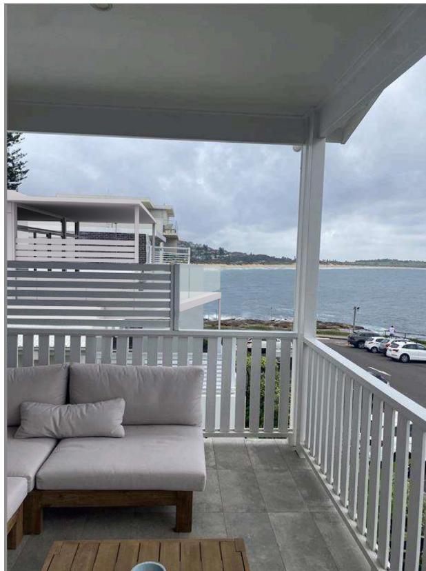
Photomontage of proposal