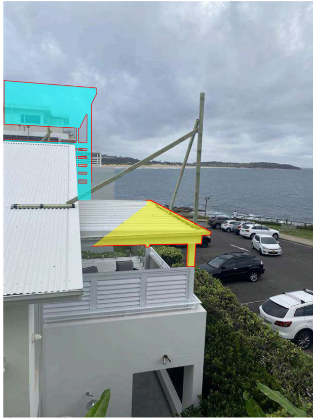
Visual impact in cyan with red outline