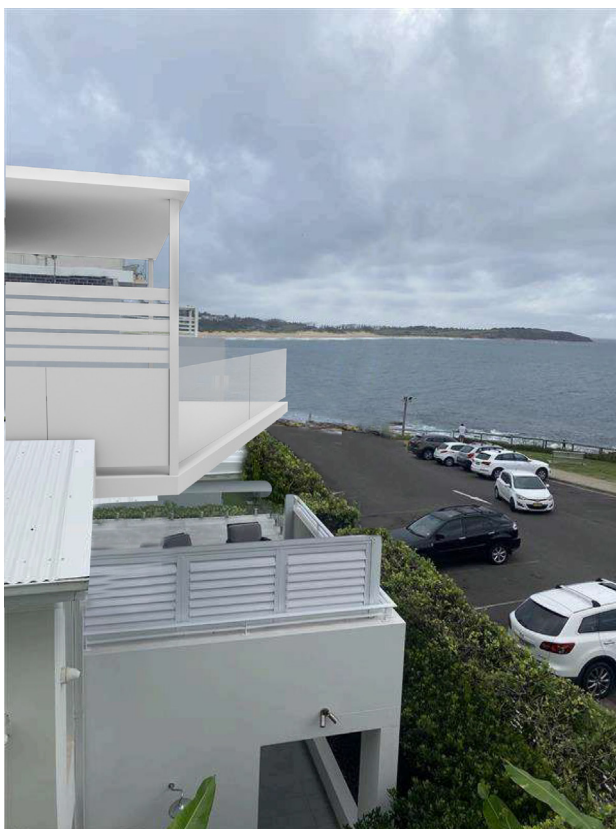
Photomontage of proposal