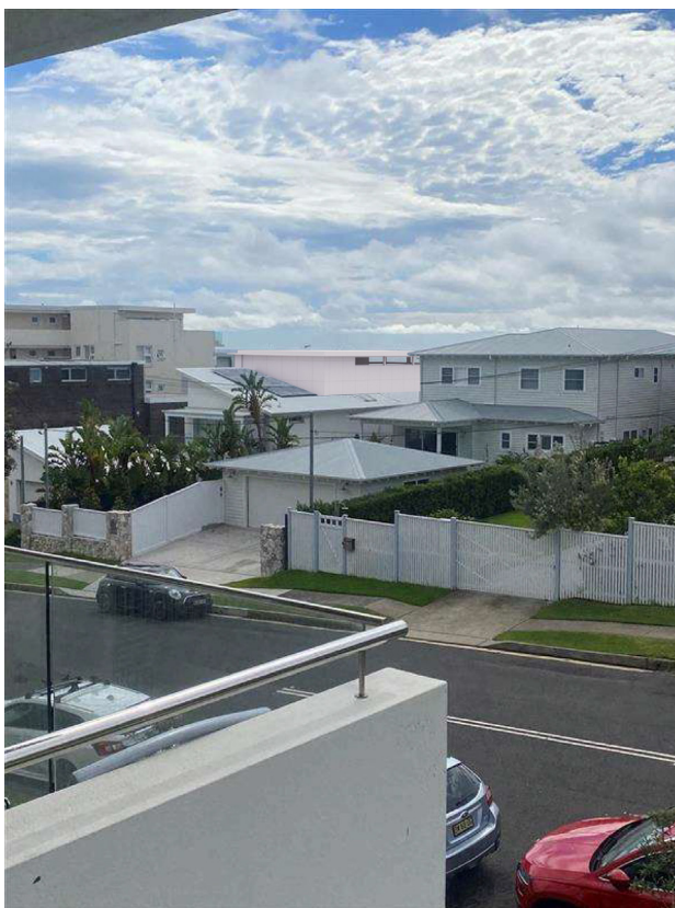
Photomontage of proposal