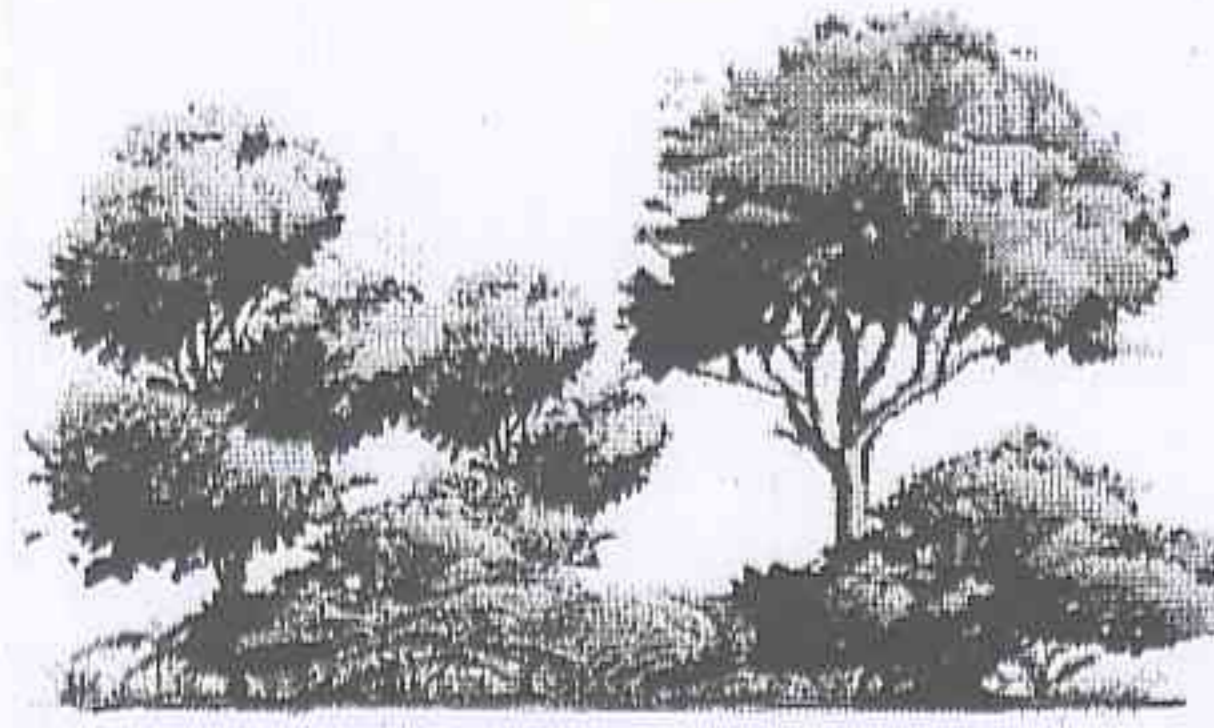
open forest bushland