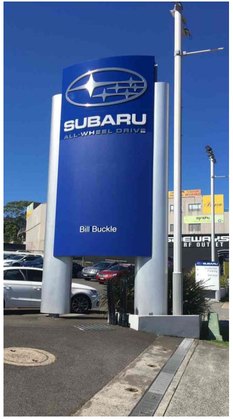
571 Pittwater Rd (Across the road)

Similar dealership pylon signs located on the opposite side of Pittwater Road.