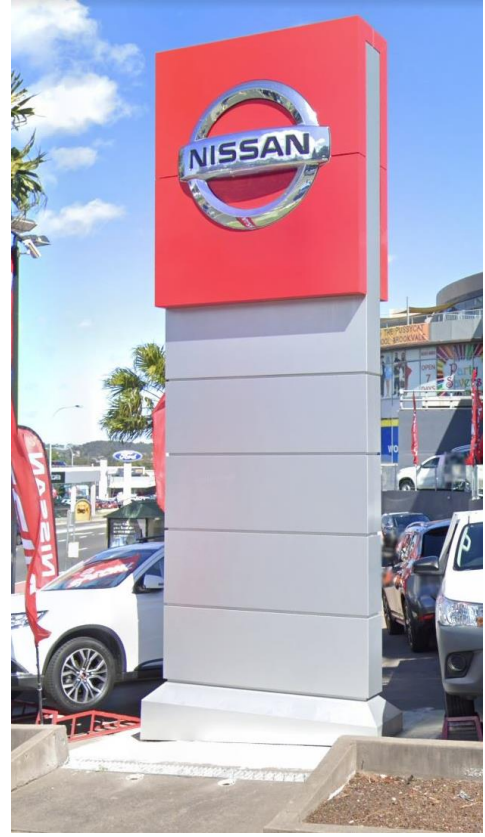
581 Pittwater Rd (Cnr Warringah Rd)

Proposed Pylon Sign at 762 – 770 Pittwater Rd