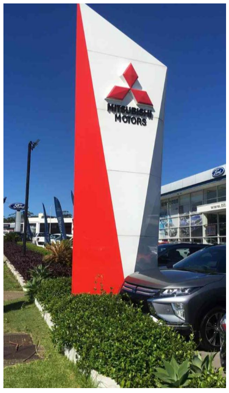
780 Pittwater Rd