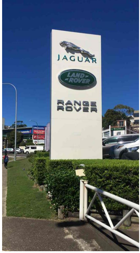
Pittwater Rd (Cnr Harbord Rd)

Similar dealership pylon signs located on the same side of Pittwater Road as the proposed sign.