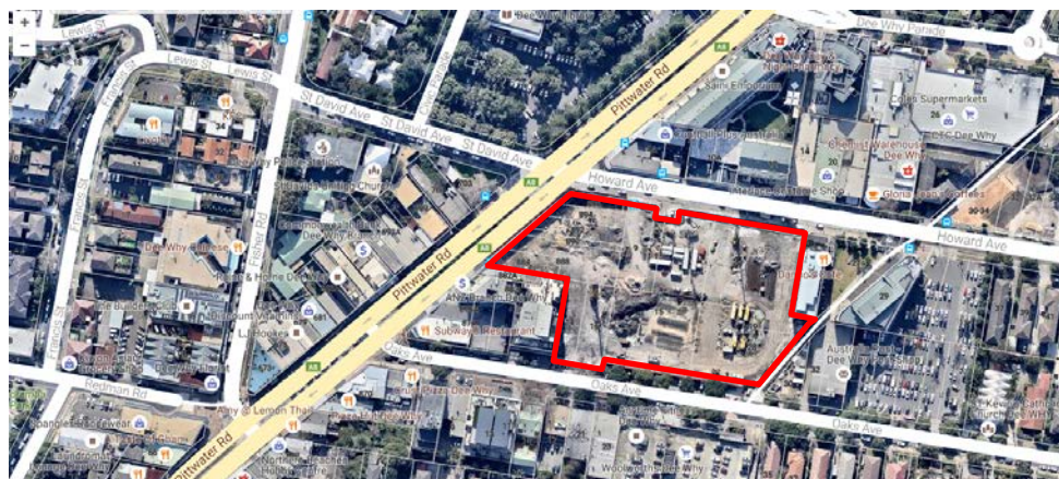
Figure 2: Aerial view of subject site - outlined in red