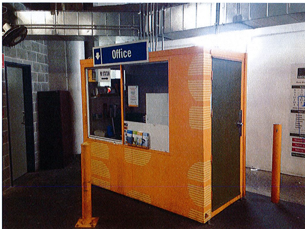
Photo 2: Unauthorised building works- Construction of a new site office to the western end of the basement (Source: Australian Facilities Solutions Pty Ltd, 2013).