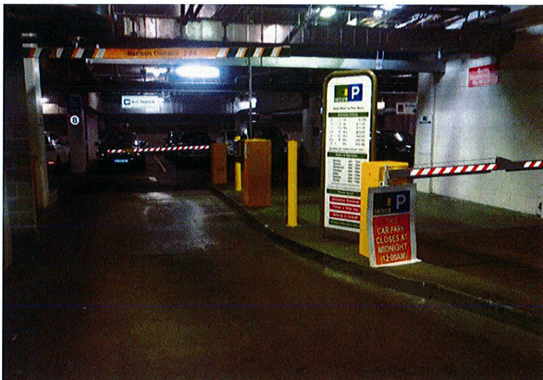
Photo 1: Unauthorised building works- Construction of two new boom gates to the entry to the basement car park (Source: Australian Facilities Solutions Pty Ltd, 2013).