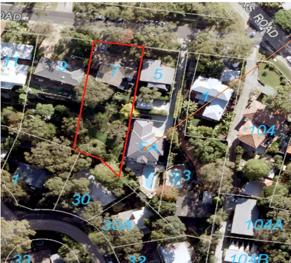
Figure 1 – Aerial photo of subject site and proximity to my client's property