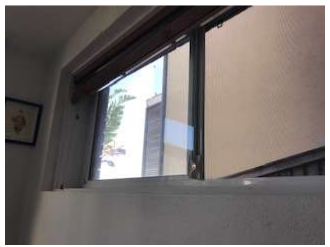
Bedroom 5 window

After consideration , we note that also the main kitchen on our upper floor will be impacted ,Claire was going to take a photo then did not