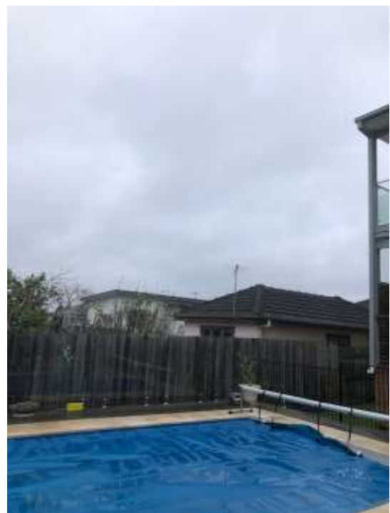
View looking back from pool area