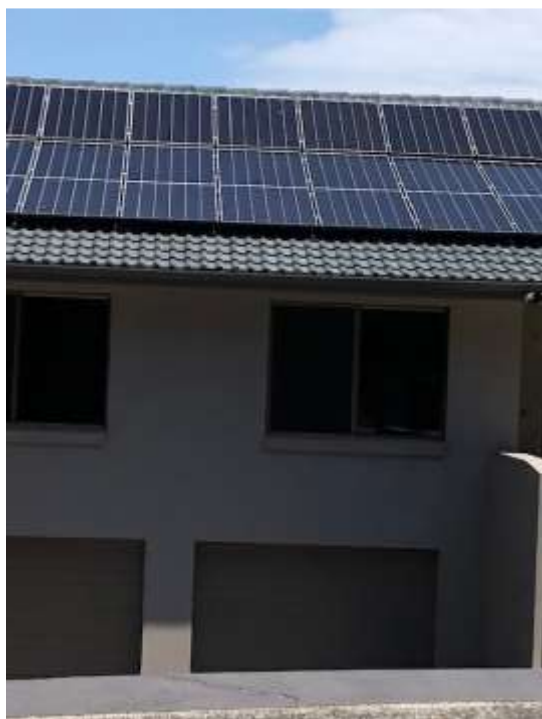
Presumed future outlook from same window