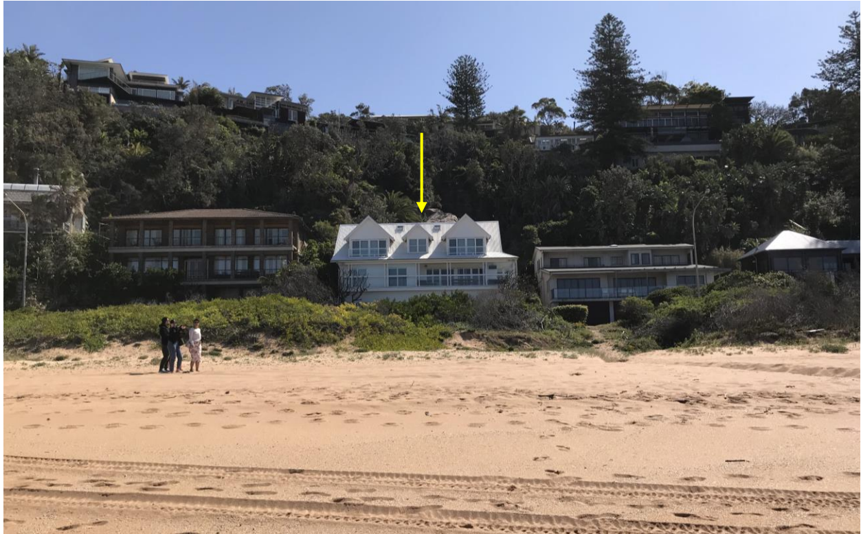
Figure 2: View of subject property (dwelling at arrow) from Palm Beach on 7 August 2019, looking west