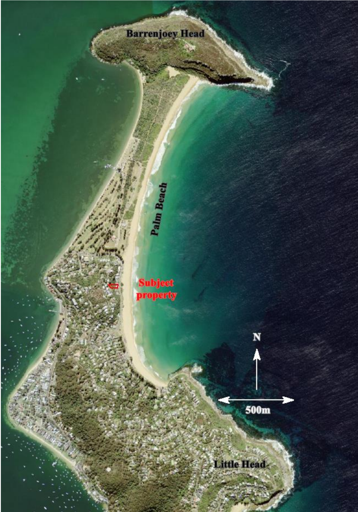
Figure 1: Aerial view of subject property on 30 August 2018