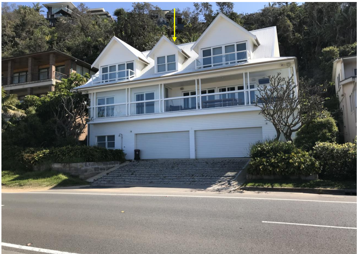
Figure 3: View of subject property (dwelling at arrow) from Ocean Road on 7 August 2019, looking WSW